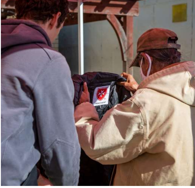
* = Deceased