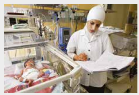
Internationally, a 'Doctor-to-Doctor' platform was launched to connect experts in infectious diseases, epidemiology, emergency medicine, together with policymakers from different countries to promote a better understanding of the virus and the treatment of patients, and to create a forum for discussion and exchange of experiences.