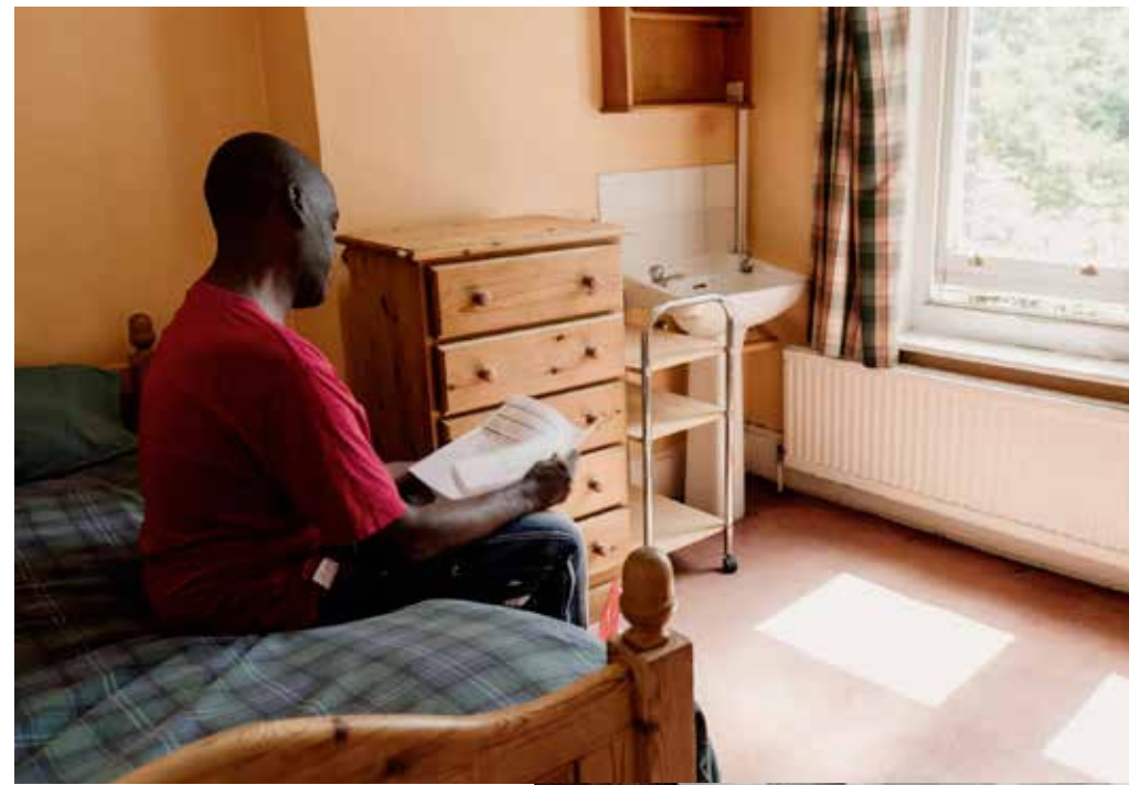
Residents learn new skills

Two 'first-stage' houses went into lockdown in March and reopened in June when the staff also returned to ensure a partial personal service operating within strict social distancing rules. The provision of accommodation and support in Nehemiah's second and third stage houses has been expanded, with the help of the Global Fund, with an additional property close by in Croydon which means that, although the original house in Streatham is being refurbished, the actual reduction in bed space is minimal. The average occupancy rate has remained steady at around 75% and, once the refurbishment is complete. Nehemiah can accommodate more than 30 men