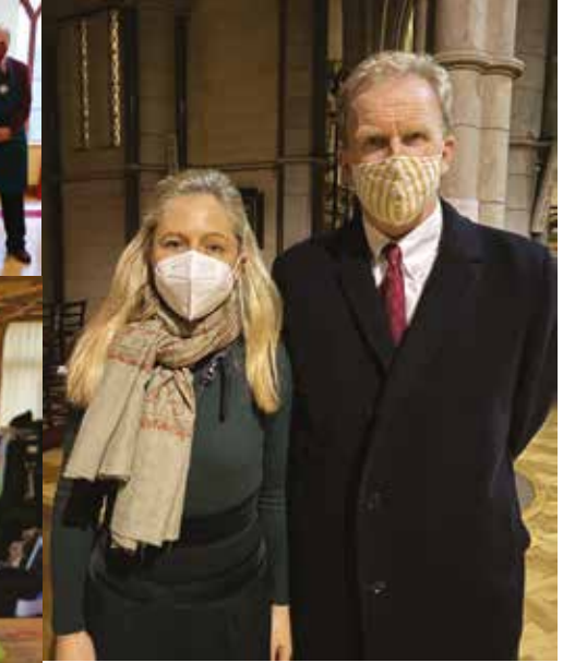
Assistance in Oxford, Scotland, London, to help the homeless