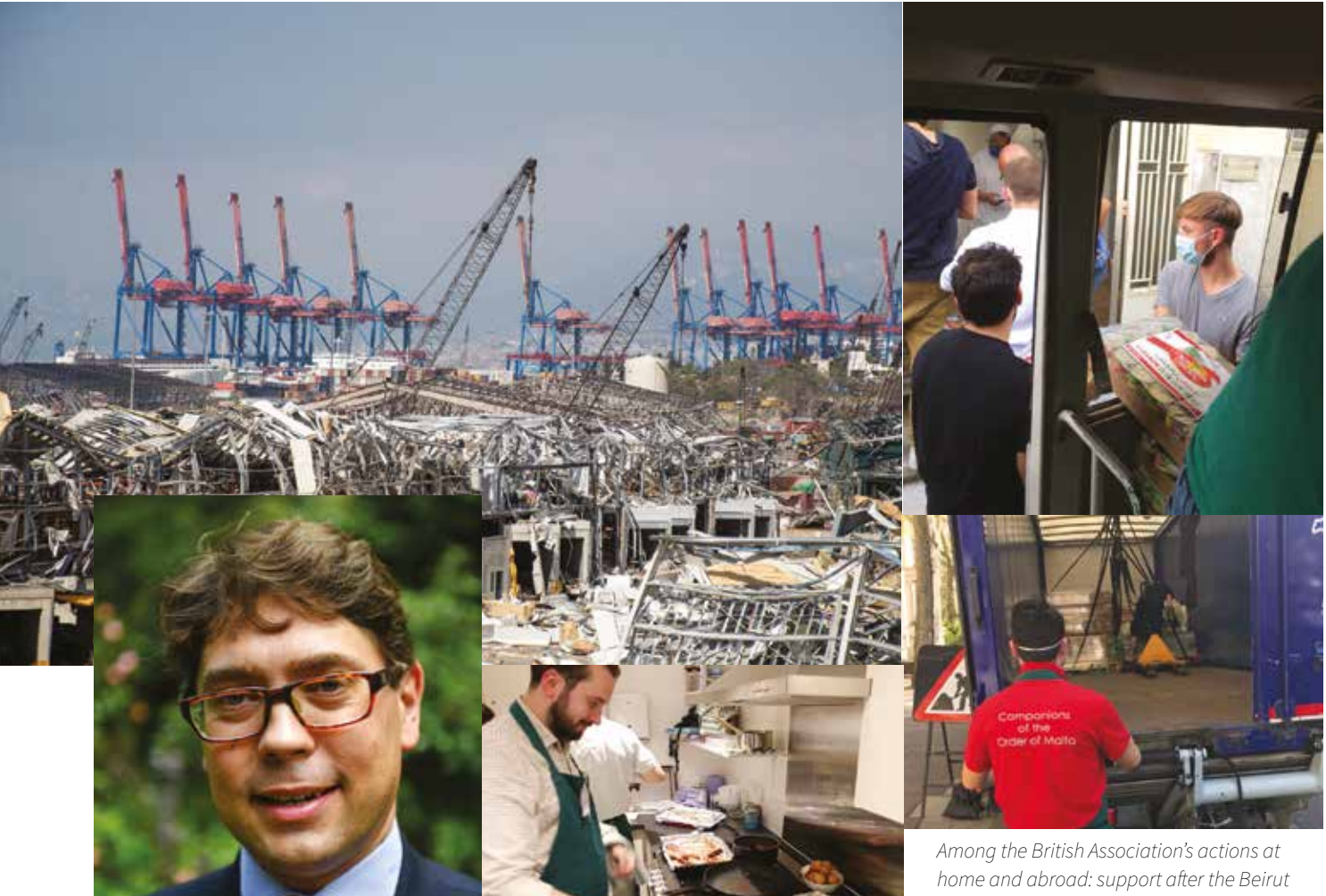
Among the British Associations actions at home and abroad: support after the Beirut blast; supplies delivered to the needy; the Breakfast Club dishes up