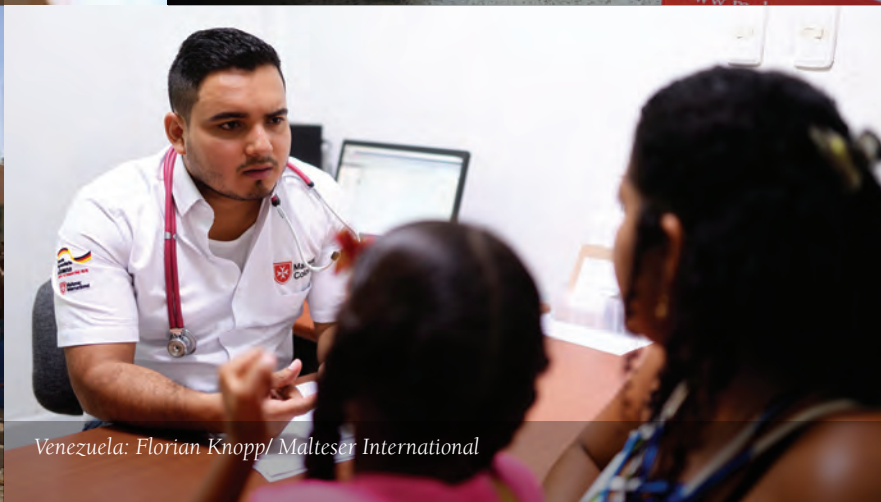
Venezuela