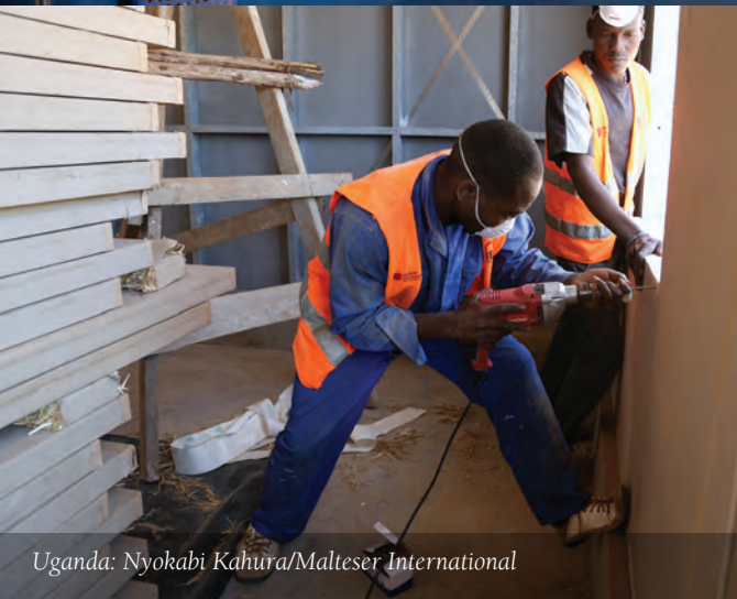
Uganda: Nyokabi Kahura/Malteser International

The Order's international emergency service, Malteser International, is there when conflicts and disasters, natural or manmade, occur. Currently in 30 countries, they run more than 100 projects to help those in great need. For more information: www.malteser-international.org