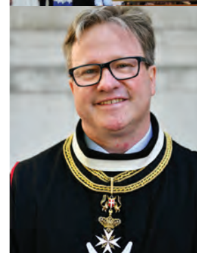
'Any article will be too short to talk about all the wonderful things that I have seen while on the Council'