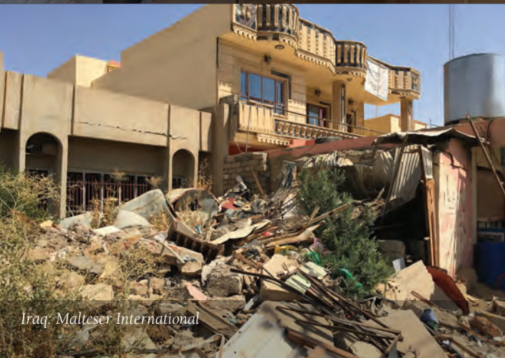
Iraq: Malteser International