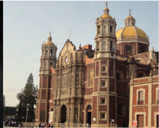
Left: L'Aquila earthquake; above: Our Lady of Guadalupe cathedral