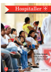
Cover photo: Refugees from Venezuela.

16 Stop Press News from around the Order's world