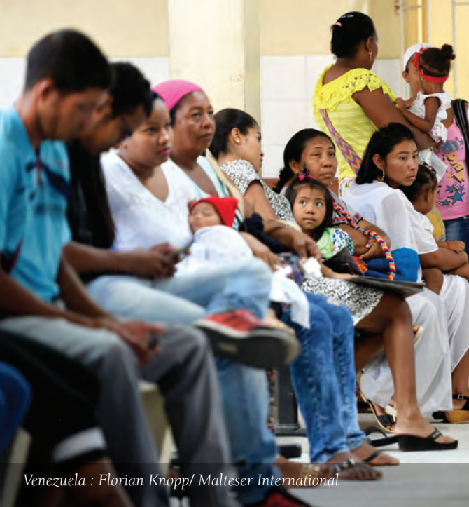
Venezuela