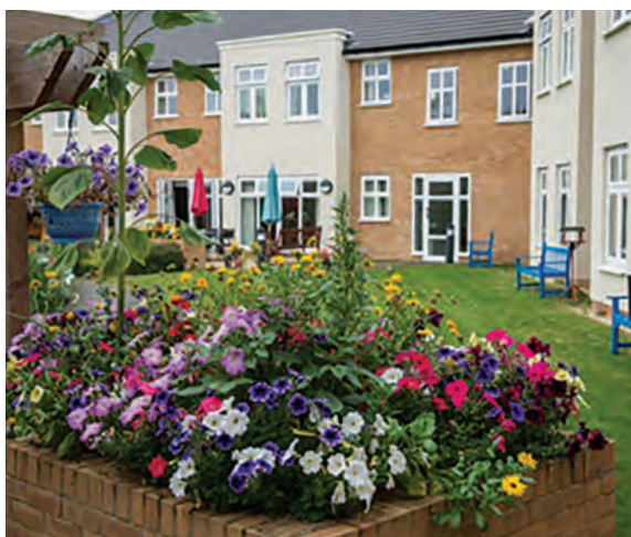
Langford View, Oxfordshire