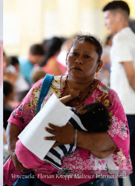
Venezuela