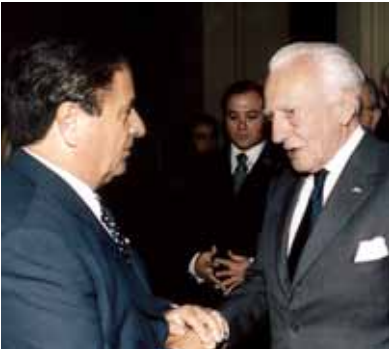
Argentina – H.E. Eduardo Duhalde