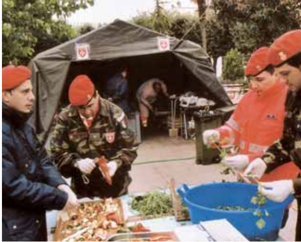
Members and volunteers from the Italian Association's Military Corps bring food and shelter to earthquake victims, southern Italy, Autumn 2002

Elsewhere in the region, the Order focused its attention on providing a 'full service package' to three small towns. Bad Schandau, south of Dresden, had a flourishing tourist industry, but the entire area was covered in mud, including all the hotels. In Prettin, north of Dresden, high unemployment had resulted from the impact of the flooding on surrounding farmland, while in Großtreben-Zwethau, damage to the local infrastructure had also left a legacy of unemployment.