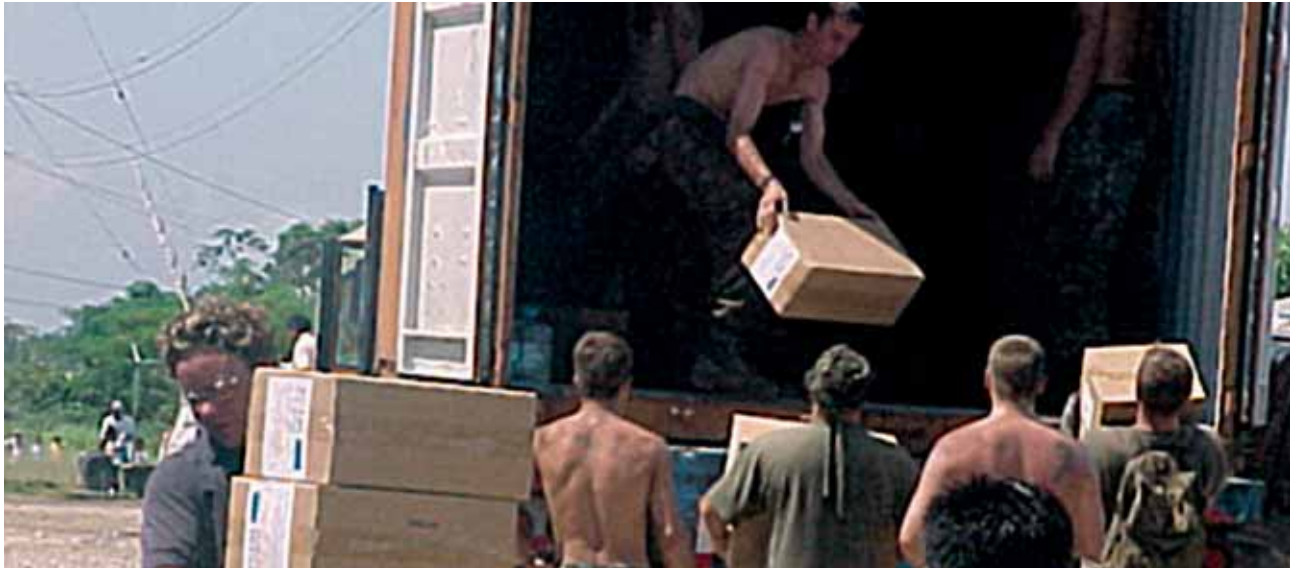
Medicines are delivered to the local population by the Order's volunteer teams, Belize

The Grand Priory of Austria has continued to collect, sort and distribute medicines and medical equipment to hospitals, homes for elderly people and nurseries in Eastern Europe.