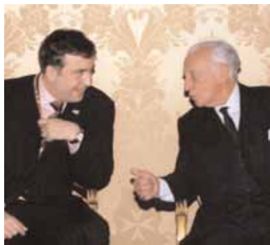
Georgia – H.E. Mikheil Saakashvili