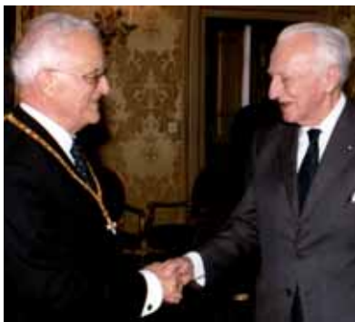
Malta – H.E. Edward Fenech Adami