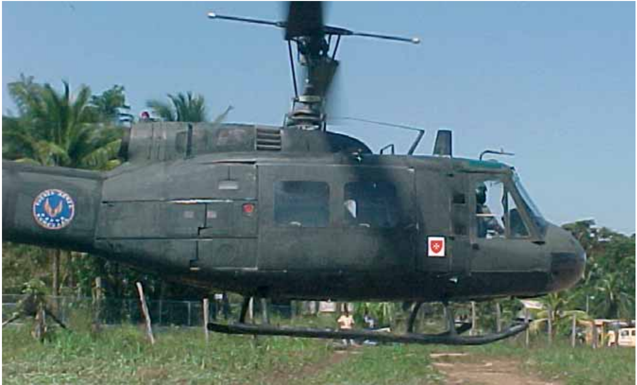
Cooperative activities: transporting medical supplies in South America

The Order's volunteer corps in Lithuania (Maltos Ordino Pagalbos Tarnyba), has continued to grow strongly to form a network for delivering social and humanitarian aid in which recent activities have included: