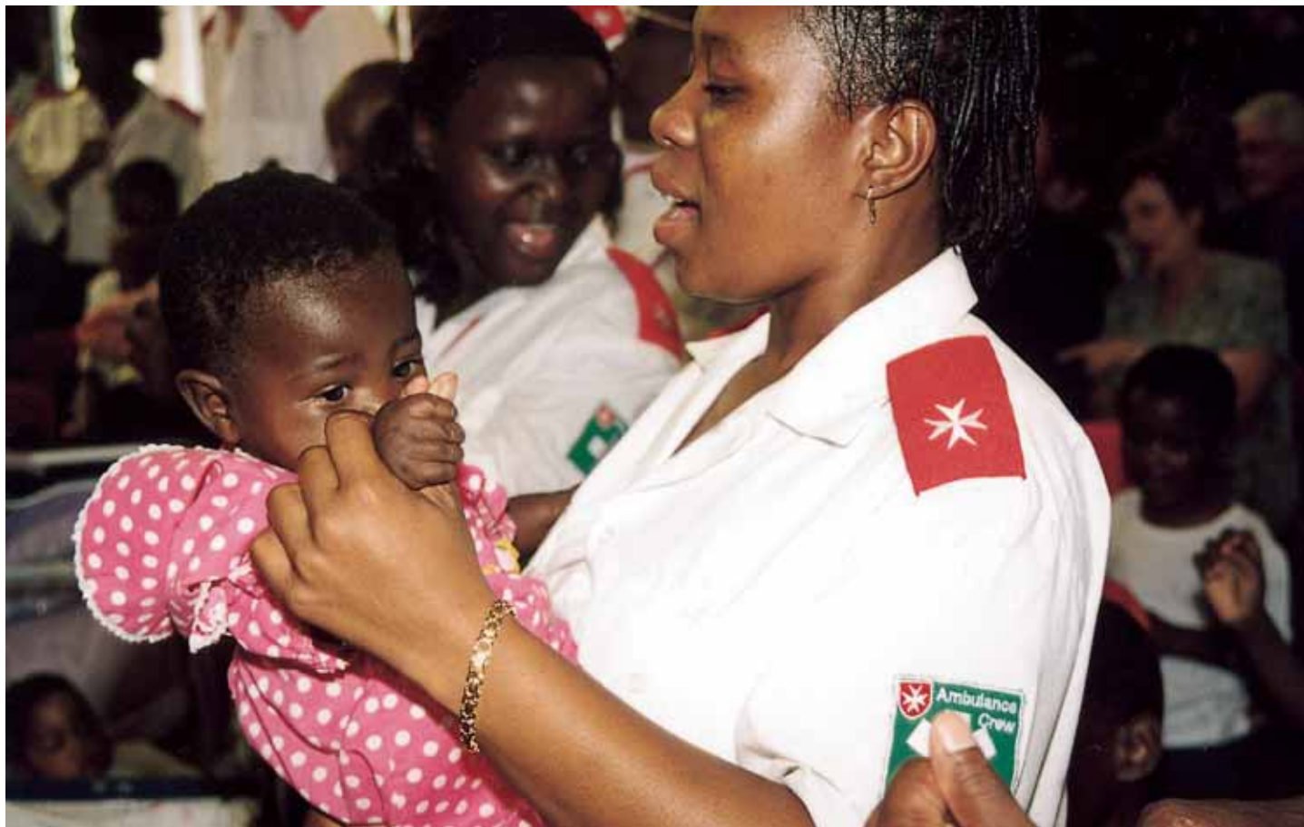
South Africa: the Order's HIV/AIDS Hospice cares for afflicted mothers and their babies