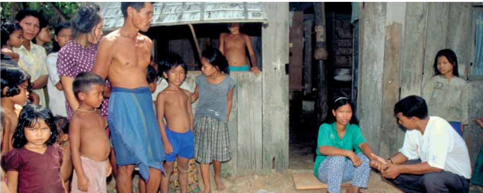
A CIOMAL doctor visiting patients in Thailand

"In these cases there is a very real risk of blindness, and a leprosy patient who has lost the sensation in hands, feet and eyes is a very disabled person indeed – unable to feel their way when walking, or to tell when they have food in their hand," explains Dr Griffiths.