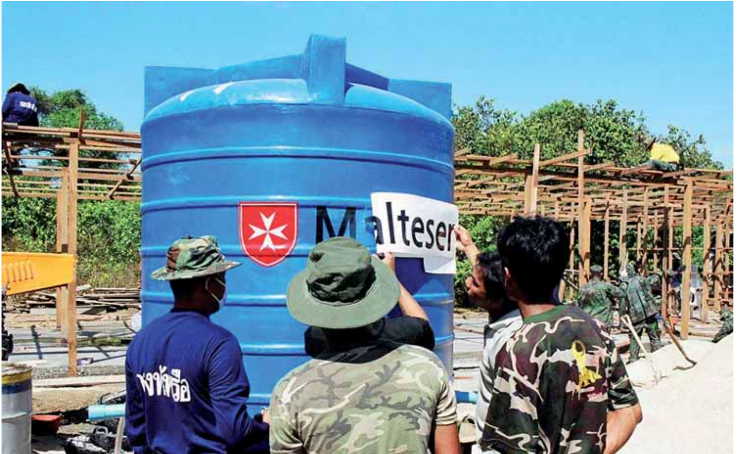
In Thailand a Malteser International team installs a much needed water tank in a tsunami-affected area