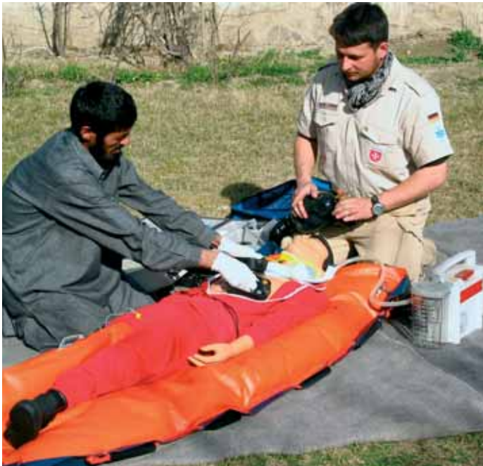
The German Association's MHD runs first aid training courses throughout the year. This one took place in Afghanistan

The Order operates to accepted national and international standards for the provision of first aid, emergency relief and humanitarian aid. In this way, we gain the assurance that whatever we do will be done effectively and to the greatest benefit of the people we help.