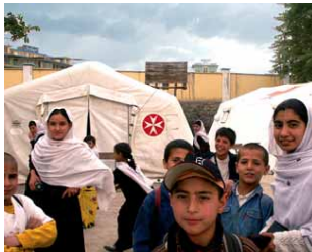
Internally displaced persons, Afghanistan, receive help at an Order outpatient clinic