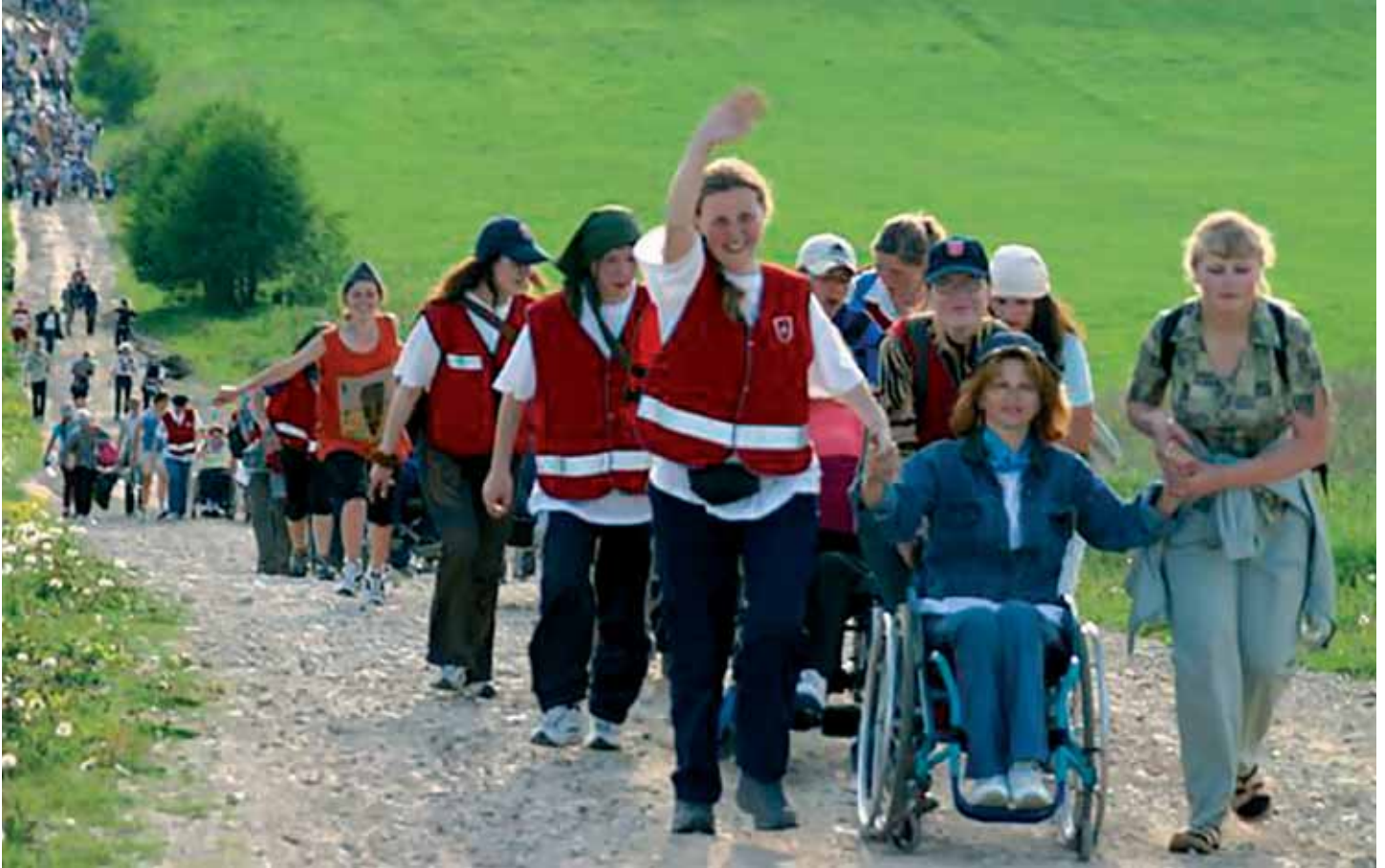
Youth pilgrimage in Lithuania – summer 2002