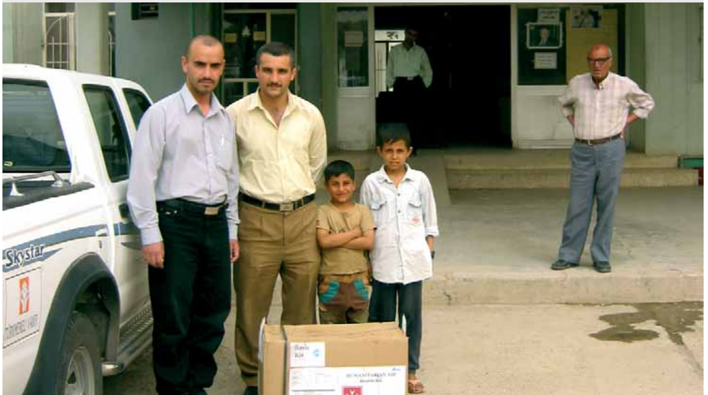
Health kits arrive in Iraq