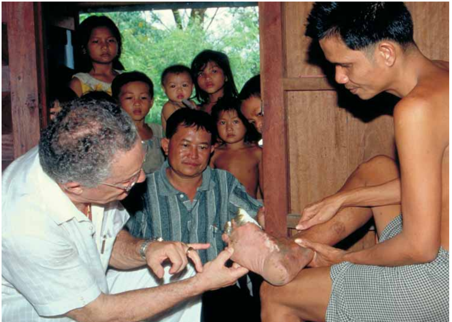
Cambodia: a CIOMAL doctor examines a young patient

The National Associations of the Order in several countries, including Germany, France, Spain and Switzerland are engaged in providing medical and palliative care for sufferers from leprosy, either through their own endeavours or through their membership of CIOMAL, an Order foundation in Geneva.