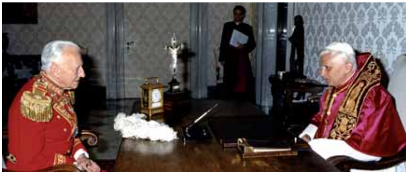
Holy See – His Holiness Pope Benedict XVI