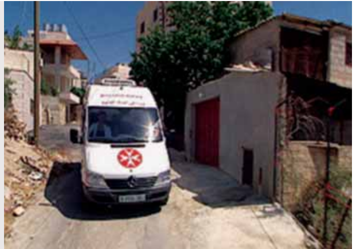
Bethlehem – Ambulances go out into the neighbourhood to collect expectant mothers

The Holy Family Hospital in Bethlehem, Palestine , is a joint project of the whole Order of Malta under the operational responsibilities of the Oeuvres Hospitalières Françaises de l'Ordre de Malte (OHFOM). The hospital provides indispensable service in the area, and offers pregnant women of the region the only possibility to give birth to their babies under good medical conditions. The first goal of the hospital has been, is, and will always be to provide high quality maternity care for all who come, regardless of race, religion, culture or social condition.