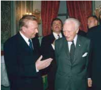
Slovakia – H.E. Rudolf Schuster