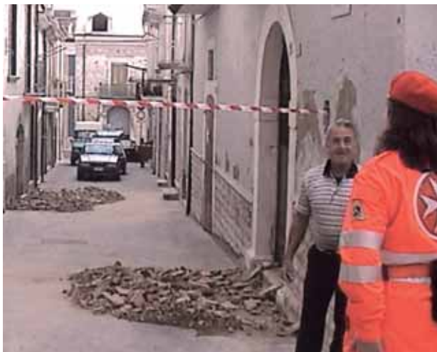
Some of the damage inflicted: a street in Casalnuovo Monterotaro, near Foggia, southern Italy