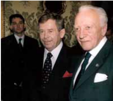
Czech Republic – H.E. Vaclav Havel