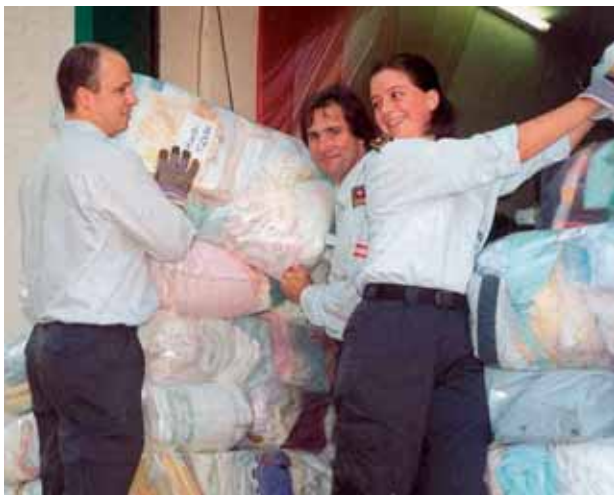
Summer 2002: Austrian volunteers help unload supplies for victims of the Central European floods

An additional 7,000 lbs of medical supplies from the Order's Honduras Association was flown by helicopter to a staging area in Punta Gorda, from where they were distributed to 11 villages which could not be reached by land. Distribution of the emergency relief, which also included rice, beans, flour and canned foods, was organised by the Order under the direction of the Belize National Emergency Management Office.