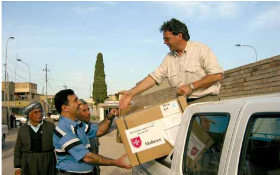
Unloading supplies for local Iraqi citizens by a Malteser International team