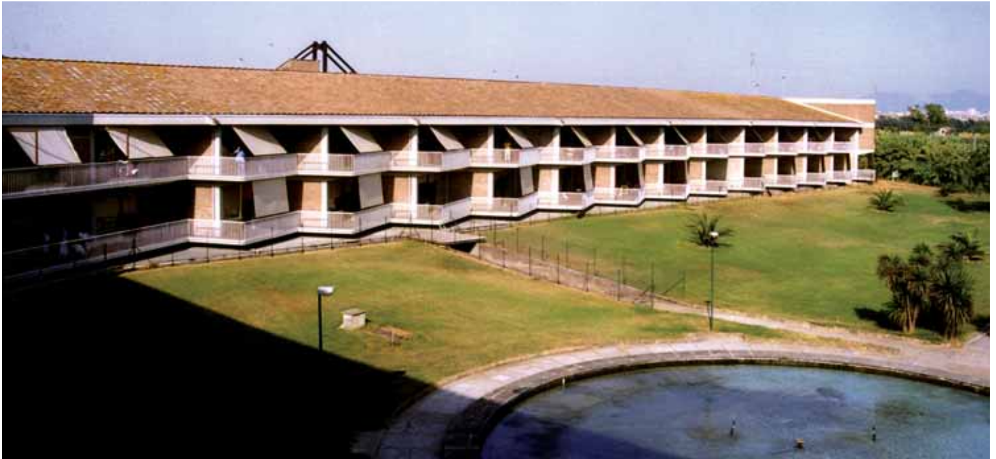
↑ The hospital of San Giovanni Battista, la Magliana