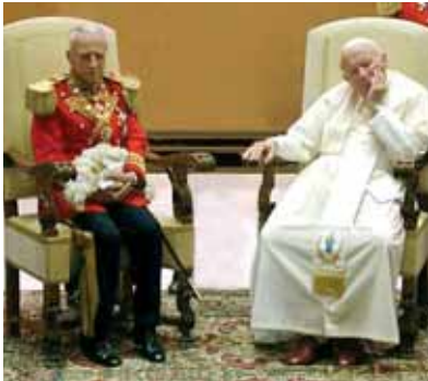
Holy See – His Holiness Pope John Paul II