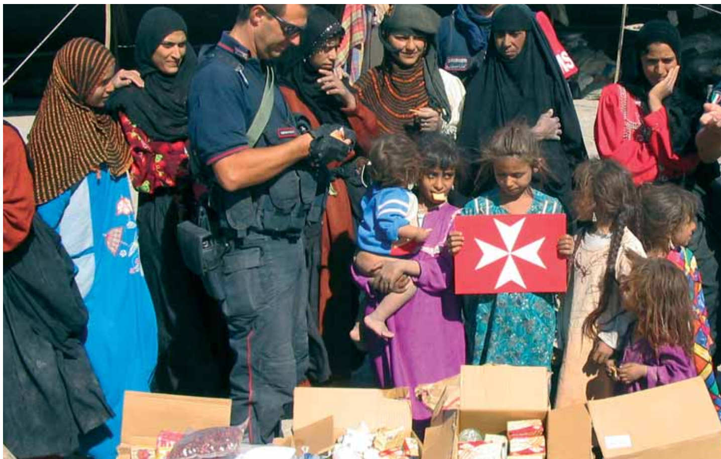
Iraqis arrive to collect food and medicines supplied by the Order's Italian Association

From the perspective of the German members of Malteser International, it was clear that the Order already had a presence in Kuwait, where the German Association had been providing medical services to the United Nations observation mission set up to monitor the demilitarised zone between Iraq and Kuwait.