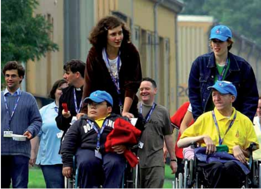
World Youth Day, Cologne, Germany