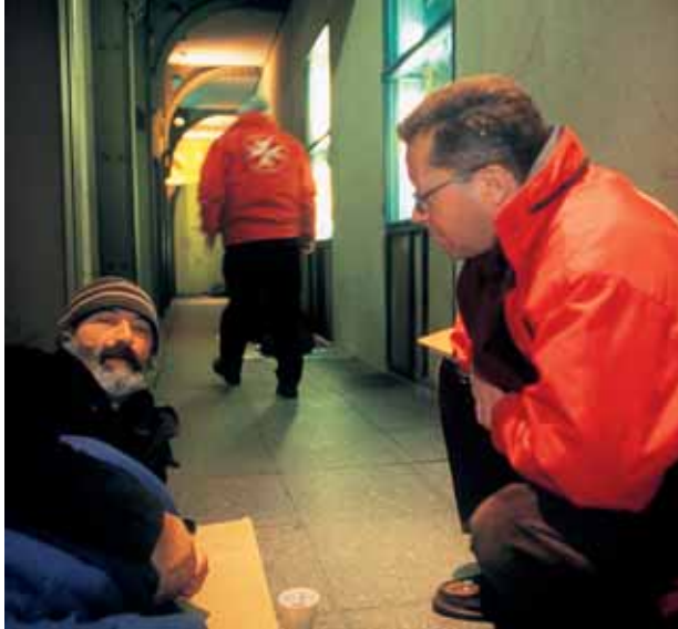
Helping the homeless in France