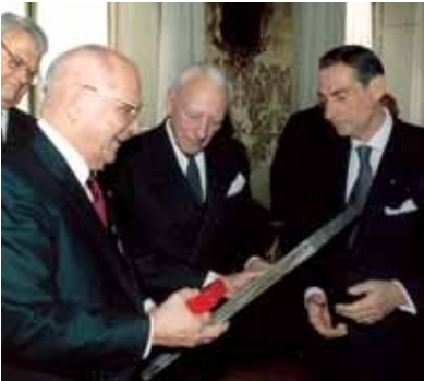
Nicaragua – H.E. Enrique Bolaños Geyer