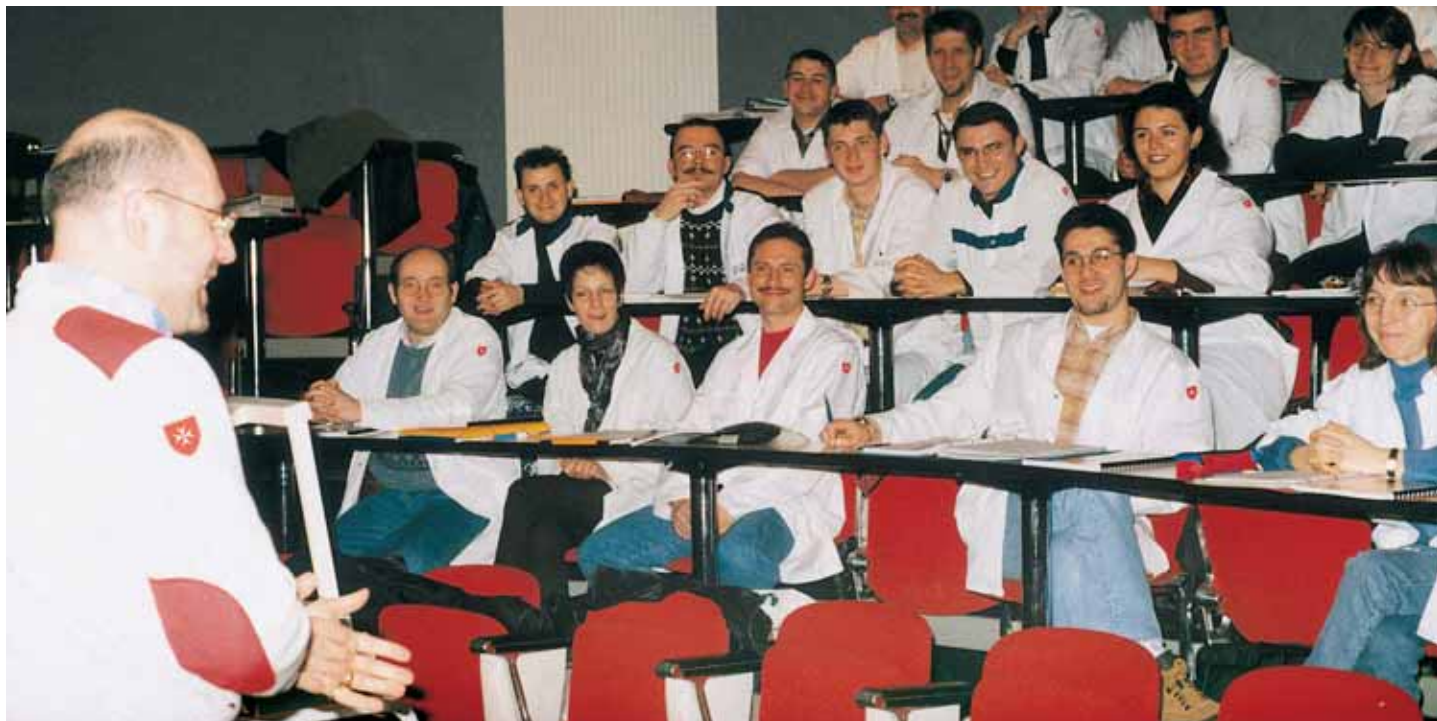
Medical first-aid auxiliaries attend refresher courses