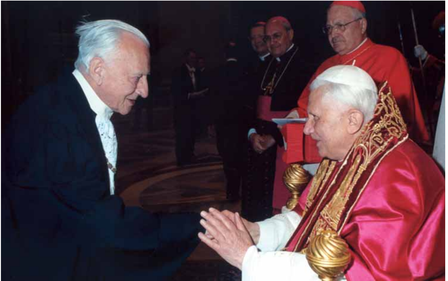
Rome, St. Peter's - The Grand Master Fra' Andrew Bertie with Pope Benedict XVI after the Mass for the Inauguration of the Pontificate of His Holiness 24 April 2005