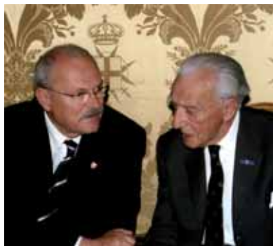
Slovakia – H.E. Ivan Gasparovic