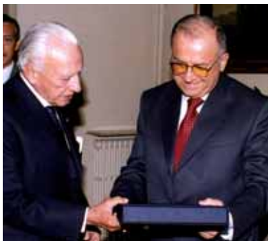
Romania – H.E. Ion Iliescu