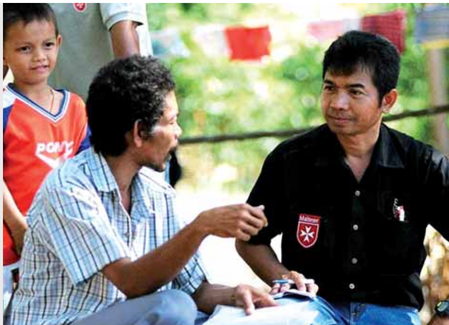
Helping Tsunami victims in Thailand

March: Oddar Meanchey Province, Cambodia – The Order's German Emergency Corps implements a Village Emergency Referral project, supported by the Cambodian Canadian Health and Nutrition Initiatives Fund, in north-west Cambodia. Volunteers in the 45 remotest villages are trained in basic first-aid, and referral plans are set up.