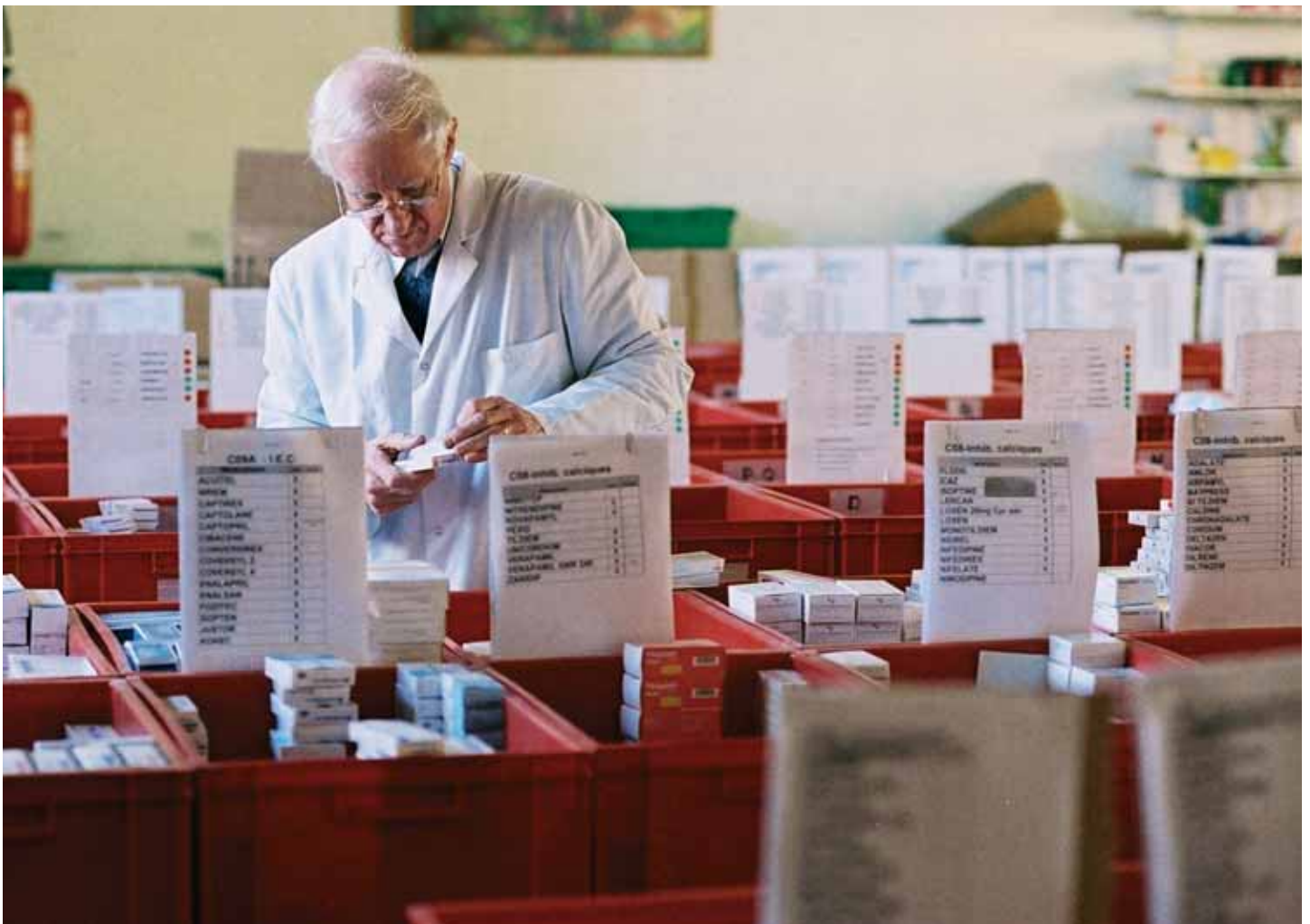
Sorting medicines at the Versailles Distribution Centre

The collection, sorting and redistribution of medical supplies to communities in need has always been an important aspect of the Order's work.