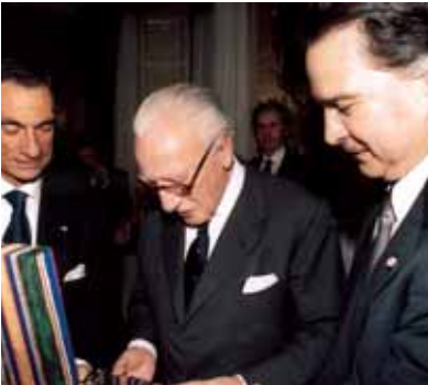
Guatemala – H.E. Alfonso Portillo Cabrera