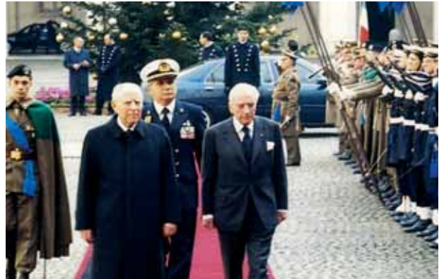
Official visit of the Grand Master to the President of the Republic of Italy,