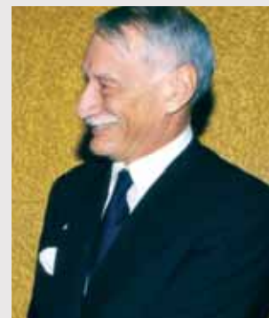
Ambassador Pierre Yves Simonin

In all these ways, the Order's diplomatic activity is contributing to the common good of all humankind.