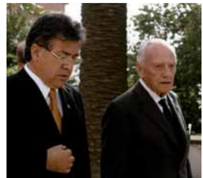
Paraguay – H.E. Nicanor Duarte Frutos