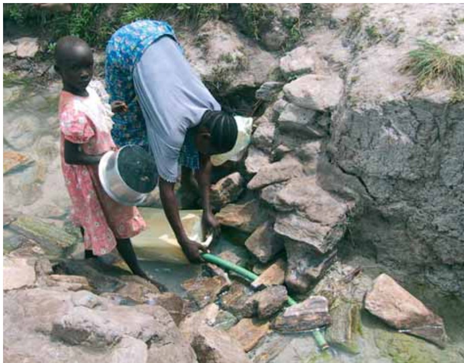
Ariwara, Africa: the German Association has provided equipment for purifying the local water supply