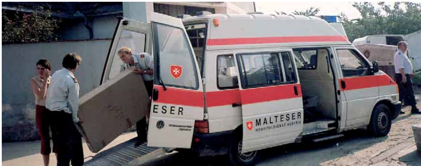
An ambulance of the Order's Austrian MHDA in Lower Austria, summer 2001