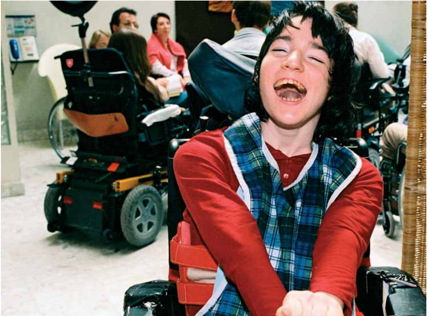
A young patient ↓