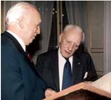
Hungary – H.E. Ferenc Madl