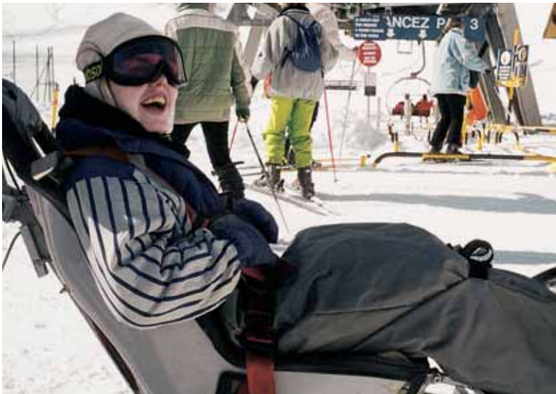
Going skiing with the help of volunteers from the French Association

team of young volunteers equipped with basic first aid skills to render assistance and relief support in the event of a natural emergency such as an earthquake or a hurricane.