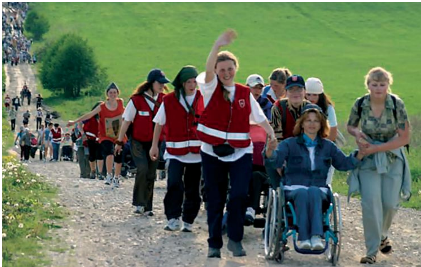
Youth pilgrimage in Lithuania – summer 2002