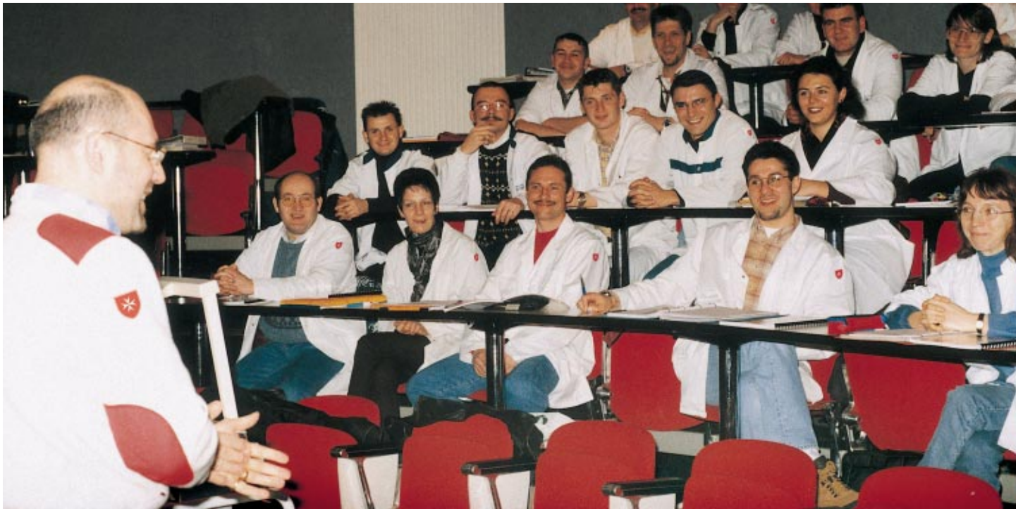
Medical first-aid auxiliaries attend refresher courses