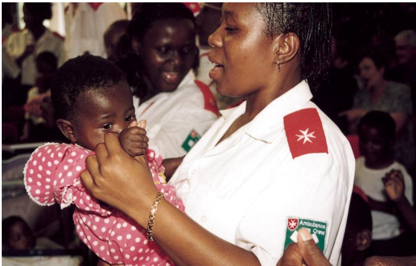
South Africa: the Order's HIV/AIDS Hospice cares for afflicted mothers and their babies