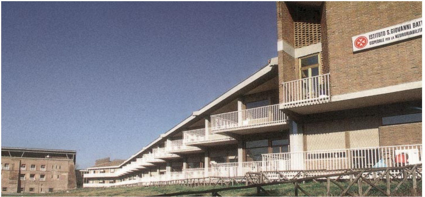
The hospital of San Giovanni Battista, la Magliana