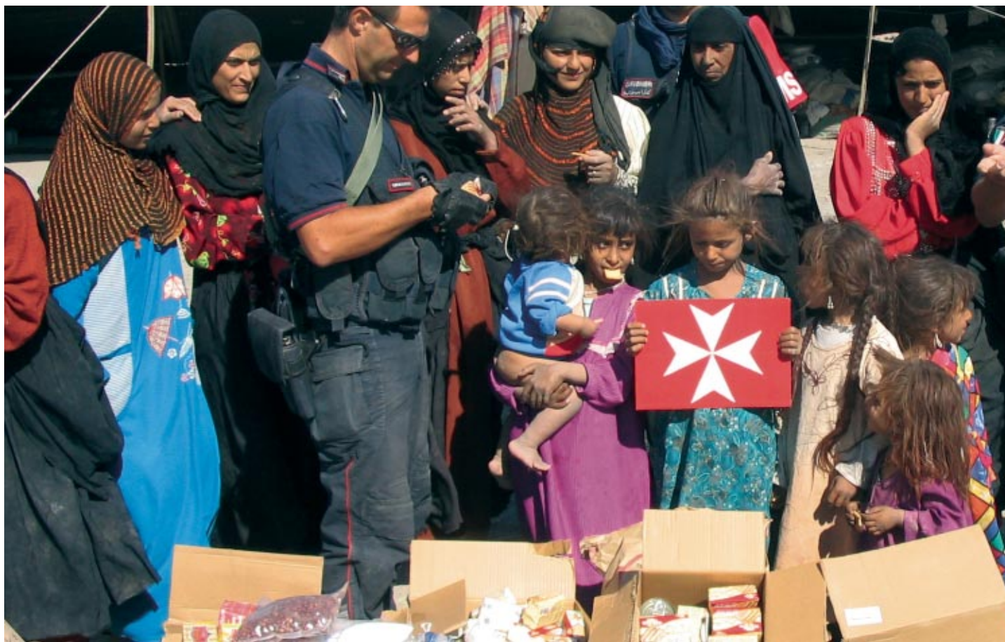
Iraqis arrive to collect food and medicines supplied by the Order's Italian Association

It was decided that the German members of the Corps would direct their humanitarian aid initiative through Turkey into Northern Iraq and that their French counterpart would enter Iraq through Jordan with the support of the Order's Ambassador in Lebanon, and then concentrate on providing humanitarian aid to Iraqi citizens in and around Baghdad.