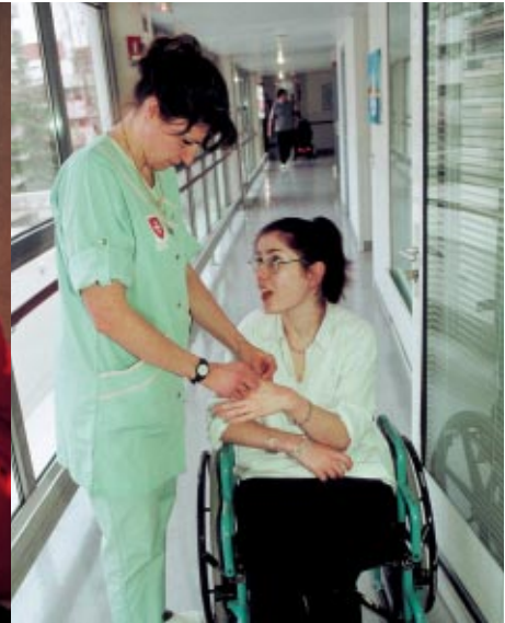
Helping the homeless in France; a clinic for the handicapped, France

Association continues to provide medical support through the Sao Paolo Health Centre Cruz de Malta.