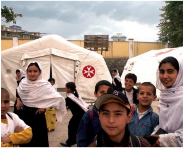
Internally displaced persons, Afghanistan, receive help at an Order outpatient clinic