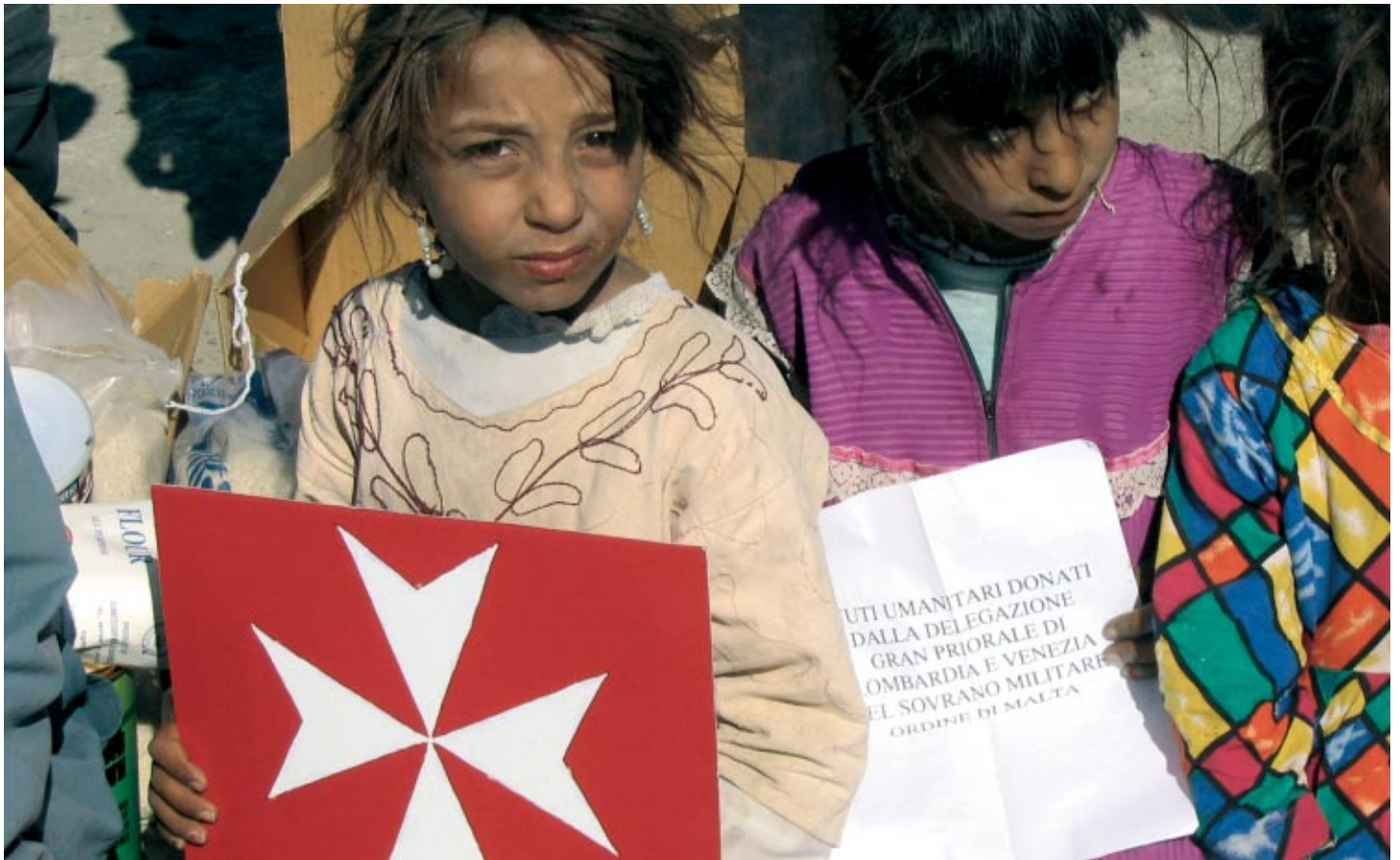
Internally displaced persons, Afghanistan, queue up for the Order's clinic in the north of the country. Here, supplies have been donated by the Grand Priory of Lombardy and Venetia