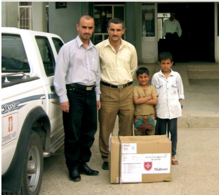
Health kits arrive in Iraq

"We discounted entering Iraq from either Iran or Syria as we had no experience or involvement in either country. This narrowed our choices down to Turkey – which would put us close to Northern Iraq where the German Association had an existing presence supporting the Kurdish population – and Jordan."