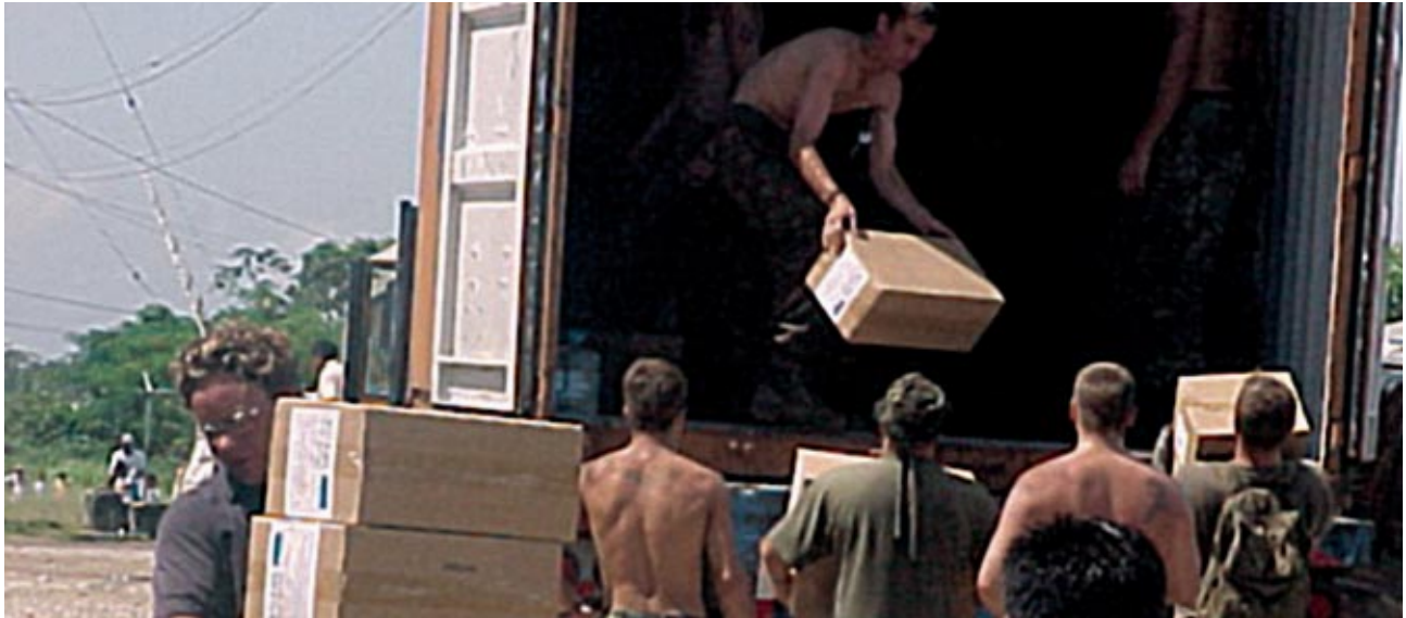
Medicines are delivered to the local population by the Order's volunteer teams, Belize

The Grand Priory of Austria has continued to collect, sort and distribute medicines and medical equipment to hospitals, homes for elderly people and nurseries in Eastern Europe.