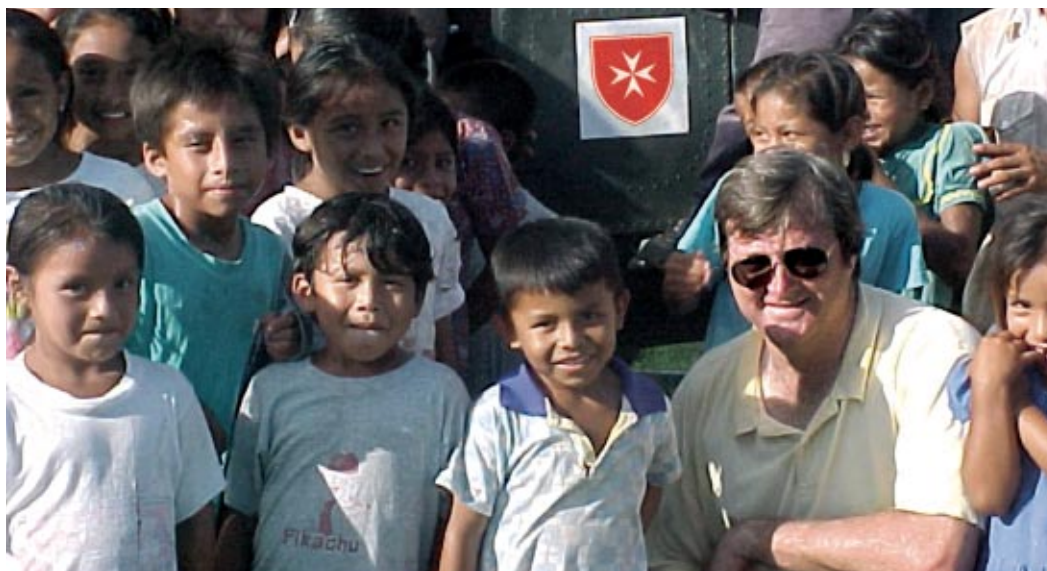
Our ambassador to Belize, Thomas Carney, brings donations of food and clothing to young hurricane victims

In Mozambique , the Corps carried out an assessment in co-operation with the United Nations Children’s Fund (UNICEF) to evaluate the situation and prepare a strategy for relief. Contacts were also established with relief organisations in Malawi and Zimbabwe , and plans have been made for a comprehensive relief programme for 90,000 people in Zimbabwe with financial support from the German Foreign Office and in co-operation with the two dioceses in Zimbabwe .