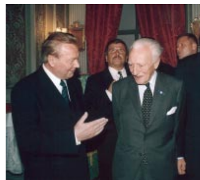
Slovakia - H.E. Rudolf Schuster