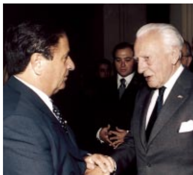
Argentina - H.E. Eduardo Duhalde