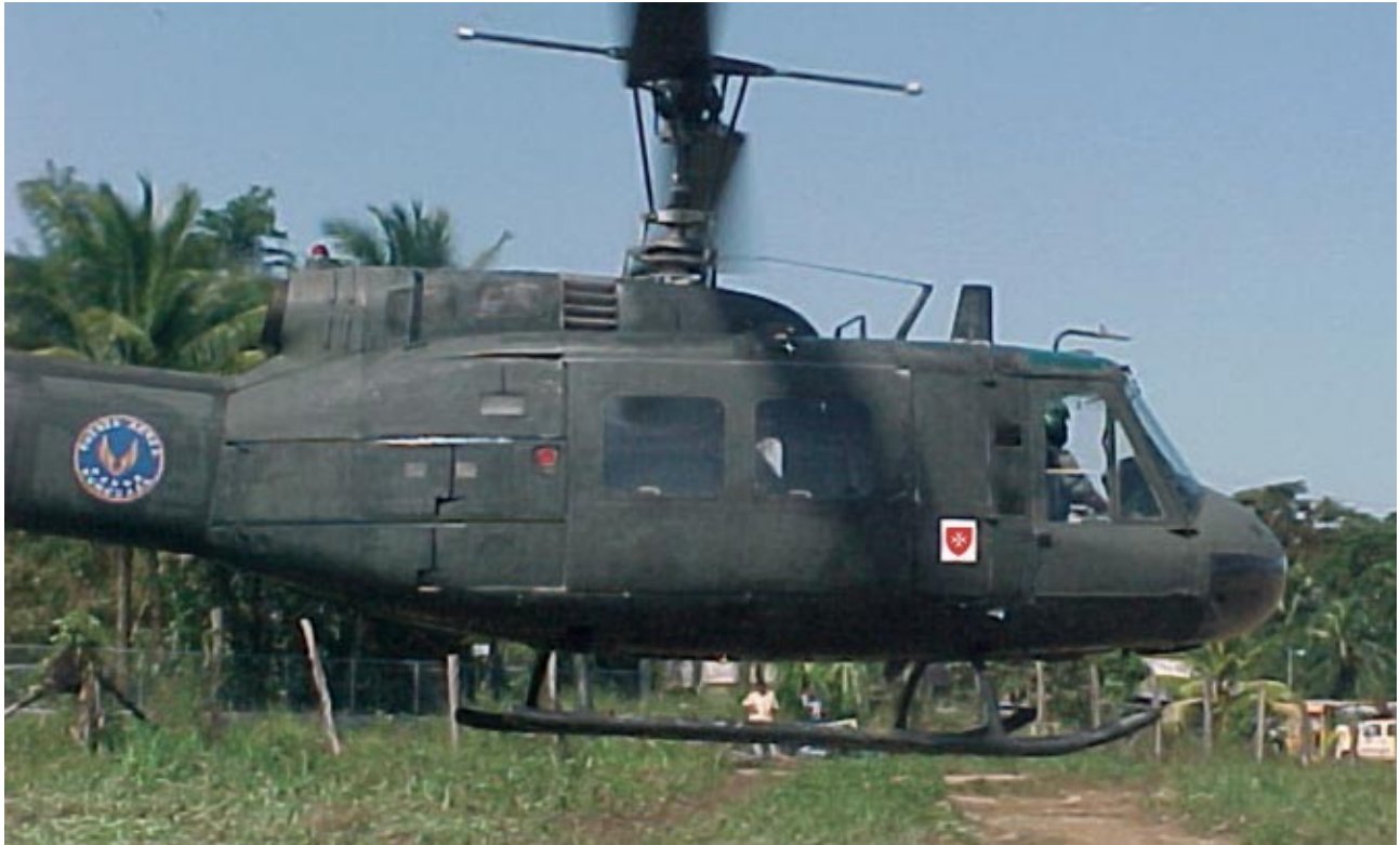
Cooperative activities: transporting medical supplies in South America

The Order's Association in Honduras provides logistical support for the CapeCARES medical volunteer teams providing basic medical care in rural communities.