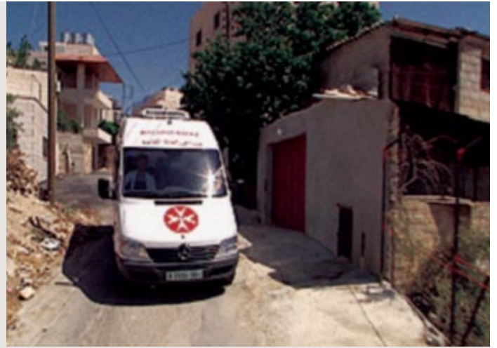
Bethlehem - Ambulances go out into the neighbourhood to collect expectant mothers

The Holy Family Hospital in Bethlehem, Palestine , is a joint project of the whole Order of Malta under the operational responsibilities of the Oeuvres Hospitalières Françaises de l'Ordre de Malte (OHFOM). Since 1990, more than 29,000 babies have been born there. The hospital provides indispensable service in the area, and offers pregnant women of the region the only possibility to give birth to their babies under good medical conditions. The first goal of the hospital has been, is, and will always be to provide high quality maternity care for all who come, regardless of race, religion, culture or social condition.