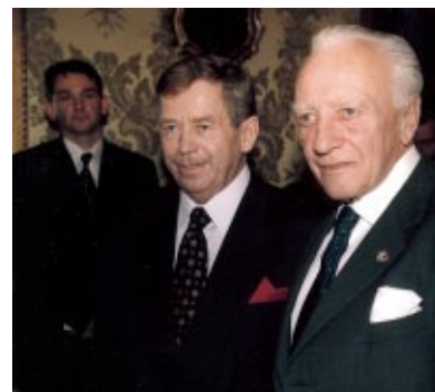
Czech Republic - H.E. Vaclav Havel