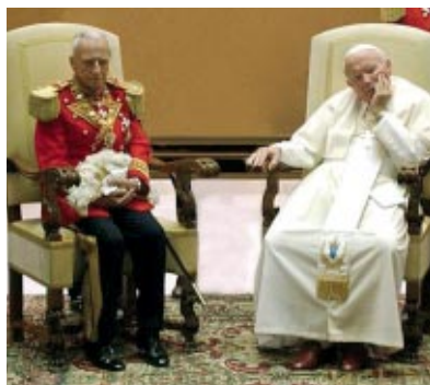
Holy See - His Holiness Pope John Paul II