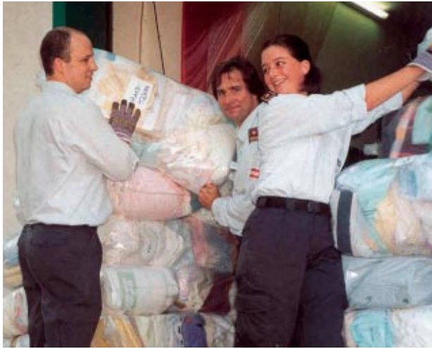
Summer 2002: Austrian volunteers help unload supplies for victims of the Central European floods

An additional 7,000 lbs of medical supplies from the Order's Honduras Association was flown by helicopter to a staging area in Punta Gorda, from where they were distributed to 11 villages which could not be reached by land. Distribution of the emergency relief, which also included rice, beans, flour and canned foods, was organised by the Order under the direction of the Belize National Emergency Management Office.