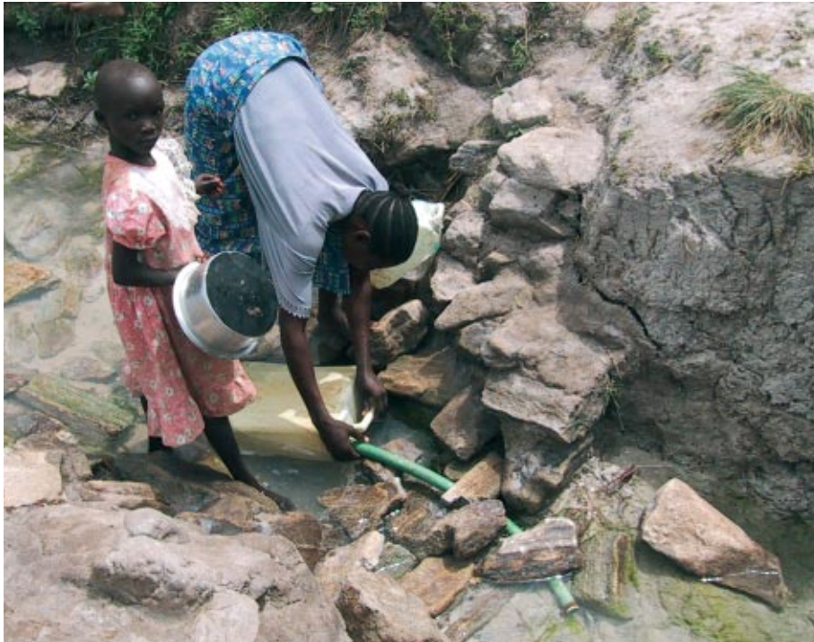
Ariwara, Africa: the German Association has provided equipment for purifying the local water supply