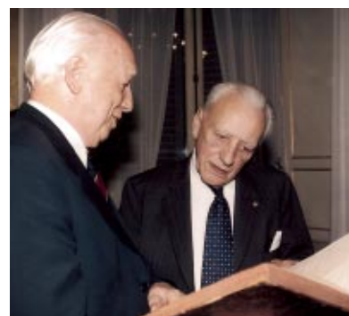
Hungary - H.E. Ferenc Madl