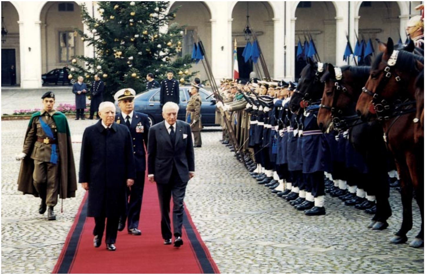
Official visit of the Grand Master to the President of the Republic of Italy, Carlo Azeglio Ciampi