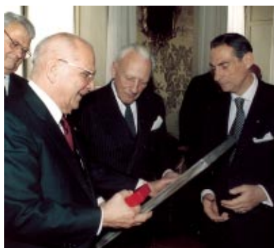
Nicaragua - H.E. Enrique Bolaños Geyer