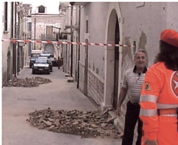
Some of the damage inflicted: a street in Casalnuovo Monterotaro, near Foggia, southern Italy

Meanwhile, volunteers took a number of ambulances to Casalnuovo Monterotaro, near Foggia, where the earthquake had caused serious damage to 80% of homes. They organised a first-aid post as well as a field kitchen and a transport service for disabled and elderly people.