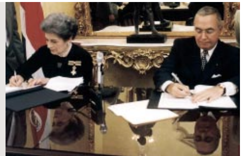
The Order's Ambassador to Costa Rica signs a Cooperation Agreement with the Minister for Health, Costa Rica, March 2002

The Order signed six Cooperation Agreements in 2001 and 2002 to offer humanitarian assistance and cooperation to countries requesting various kinds of support, ranging from humanitarian aid programmes in the form of first aid, social services, or care for the elderly and disabled, to advice and support for State health and hospital structures.