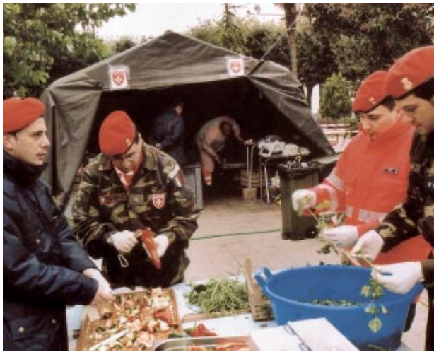
Members and volunteers from the Italian Association's Military Corps bring food and shelter to earthquake victims, southern Italy, Autumn 2002

Elsewhere in the region, the Order focused its attention on providing a 'full service package' to three small towns. Bad Schandau, south of Dresden, had a flourishing tourist industry, but the entire area was covered in mud, including all the hotels. In Prettin, north of Dresden, high unemployment had resulted from the impact of the flooding on surrounding farmland, while in Großtreben-Zwethau, damage to the local infrastructure had also left a legacy of unemployment.