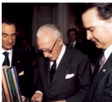
Guatemala - H.E. Alfonso Portillo Cabrera