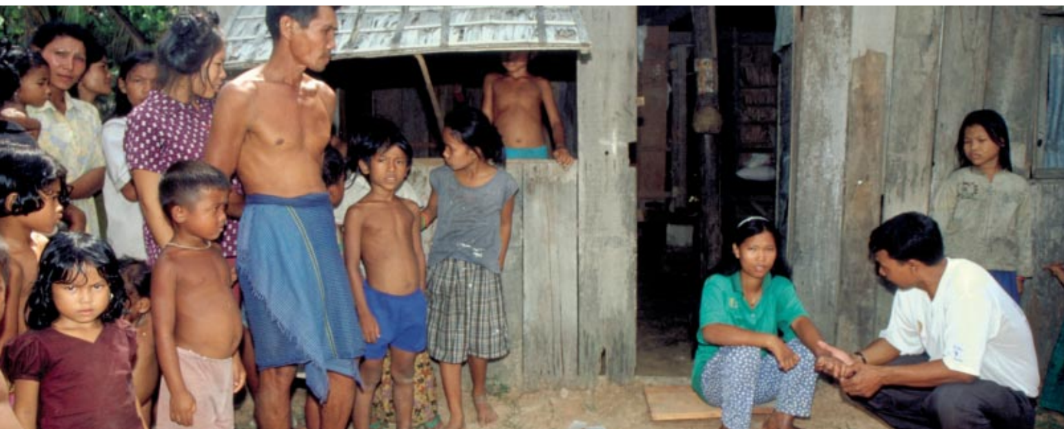
A CIOMAL doctor visiting patients in Thailand

"In these cases there is a very real risk of blindness, and a leprosy patient who has lost the sensation in hands, feet and eyes is a very disabled person indeed – unable to feel their way when walking, or to tell when they have food in their hand," explains Dr Griffiths.