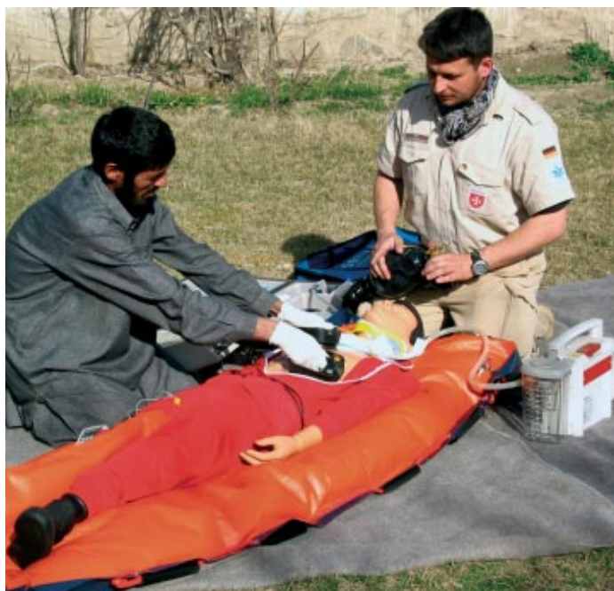
The German Association's MHD runs first aid training courses throughout the year. This one took place in Afghanistan

The Order operates to accepted national and international standards for the provision of first aid, emergency relief and humanitarian aid. In this way, we gain the assurance that whatever we do will be done effectively and to the greatest benefit of the people we help.