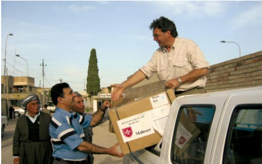
Unloading supplies for local Iraqi citizens by an ECOM team

difficult for local healthcare professionals to diagnose specific illnesses.