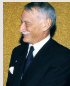
Ambassador Pierre Yves Simonin

In all these ways, the Order's diplomatic activity is contributing to the common good of all humankind.