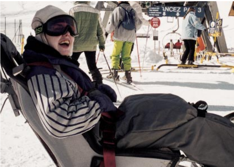
Going skiing with the help of volunteers from the French Association

and organised a cadet camp for a group of young people from Krakow and Wieliczka.