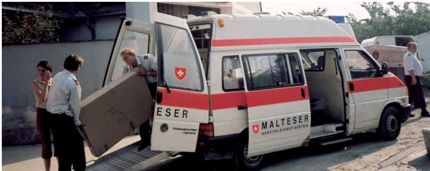
An ambulance of the Order's Austrian MHDA in Lower Austria, summer 2001