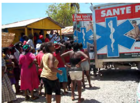
People waiting to receive hygiene kits in Belle-Anse

Immediately after both storms, Malteser International and its local partners in Belle-Anse and Port-au-Prince started emergency relief activities to help the population recover. The teams distributed construction materials so families could repair their homes, re-established the supply of safe drinking water, and cleared the drains and sewage channels. To prevent the spread of cholera, the teams distributed hygiene kits and conducted awareness campaigns. In Belle-Anse, nearly 2,000 small farmers received seeds so they could plant fruits and vegetables, such as plantains, manioc, potatoes, and beans.