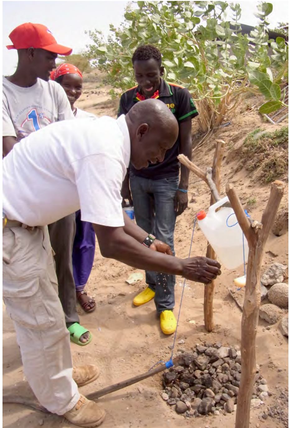
The tippy-tap is a simple, cheap and hygienic hand-washing mechanism – the user does not have to touch anything after washing his or her hands. It works with very little water, thus ideal for areas where water is scarce.