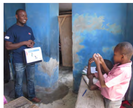
Awareness campaigns are conducted in the schools of Cité Soleil. Children learn how to properly wash their hands to prevent the spreading of diseases.

The emergency relief measures are supported by the German Federal Foreign Office. Malteser International has been active in Haiti since the earthquake of 2010, conducting projects in the areas of health and nutrition, water, sanitation and hygiene (WASH), livelihood and disaster risk reduction.