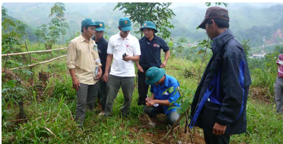
Malteser International has initiated a process to transfer woodland property rights to the population.

Persons with disabilities continue to be disadvantaged worldwide – and this is not different in Vietnam. They often have very little say in their community, and are regularly confronted with many additional barriers, social as well as structural. Due to their impairments and their marginalised position within their community, disabled persons belong to the most vulnerable group when disaster strikes. But, in Vietnam, Malteser International is working to change that: In the province of Quang Nam, often affected by floods and typhoons, a community-based disaster risk reduction project is empowering persons with disabilities in 46 villages to actively contribute to the local disaster risk reduction processes. The project promotes the direct participation of disabled persons in the village committees for disaster risk reduction, who receive additional training in early warning and inclusive evacuation. They elaborate inclusive emergency plans and test them in evacuation drills with the village population. The project receives financial support from Germany's Federal Foreign Office.