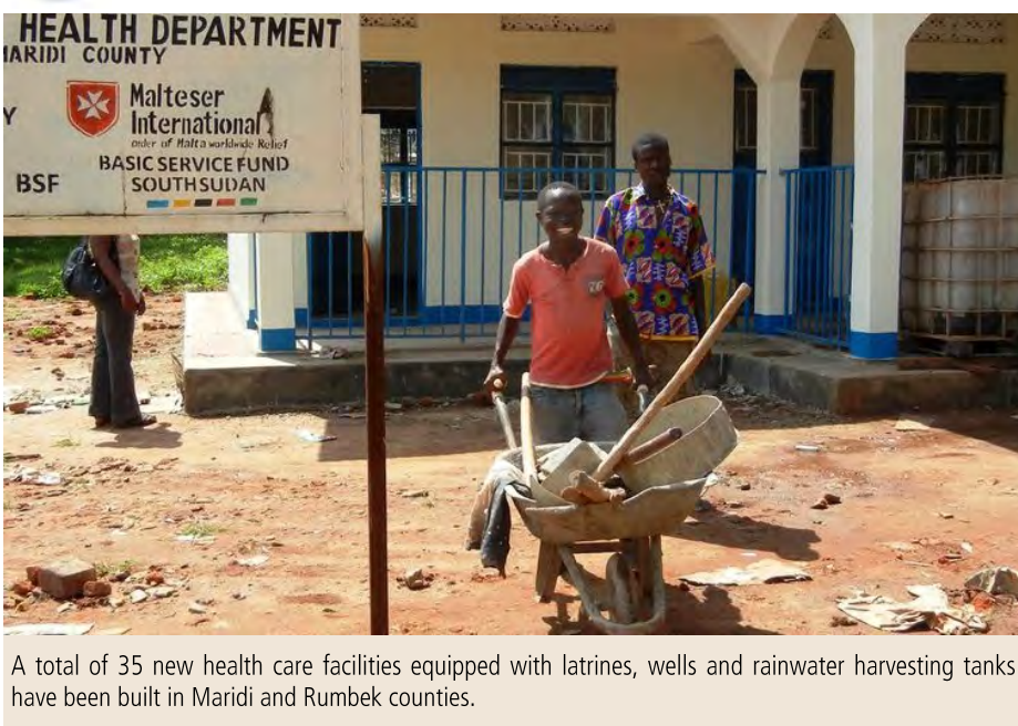
A total of 35 new health care facilities equipped with latrines, wells and rainwater harvesting tanks have been built in Maridi and Rumbek counties.

In 2012, South Sudan celebrated its first year of independence. Yet, even as the young country made its first strides in its path to development, progress in the health sector lagged far behind the country's dire needs. "Diseases such as malaria, diarrhoea, tuberculosis and HIV continue to kill the people, be-