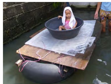
About 3 million people were affected by last year's severe floods in the Philippines.

porting families affected by Tropical Storm Washi, which devastated the northern region of the island of Mindanao in December 2011. To help families who lost everything in the flash floods start over, Malteser International built 100 temporary shelters with latrines and community faucets near the city of Illigan. The shelters were built on a raised concrete base so the residents are protected against future storms and heavy rains. In addition to the shelters, the residents received psychosocial support and were trained in disaster risk reduction. Last summer, the shelters were handed over to the local diocese, which will now help the residents transform the area