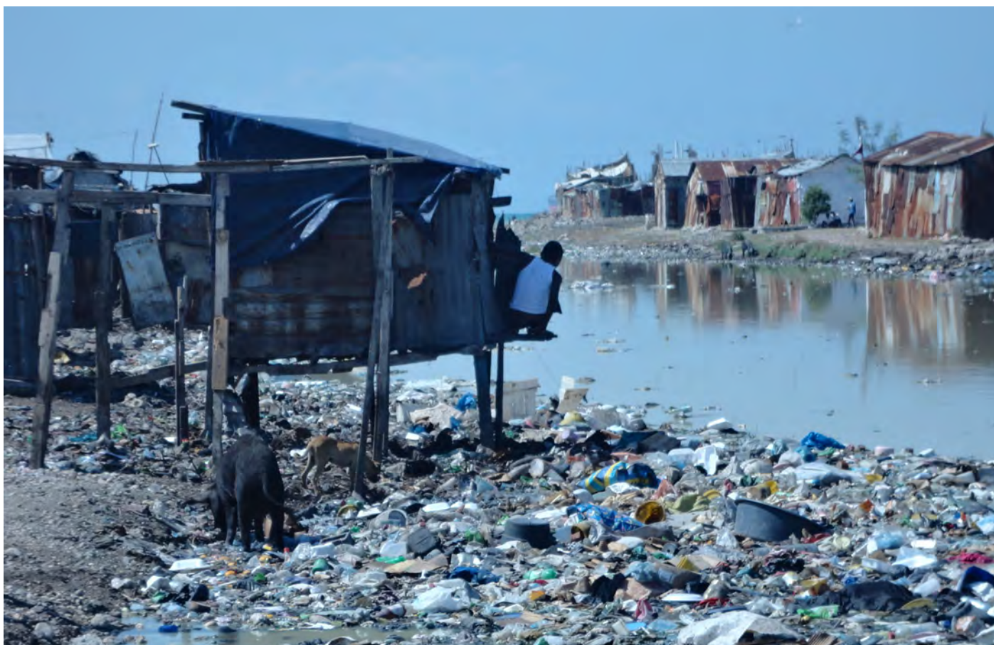
November 2012: Cité Soleil, a slum region in Haiti's capital Port-au-Prince, in the aftermath of Hurricane Sandy

The 2012 hurricane season took a heavy toll on the Haitian peninsula. Tropical storm Isaac swept through Haiti in late August, causing widespread flooding and heavy damages to the southern part of the country. In October, Hurricane Sandy followed, leaving 54 people dead and more than 30,000 displaced. The Haitian government declared a food emergency for up to 1,5 million people after vast parts of the season's harvest were destroyed. In Belle-Anse, a poor rural region on Hai-