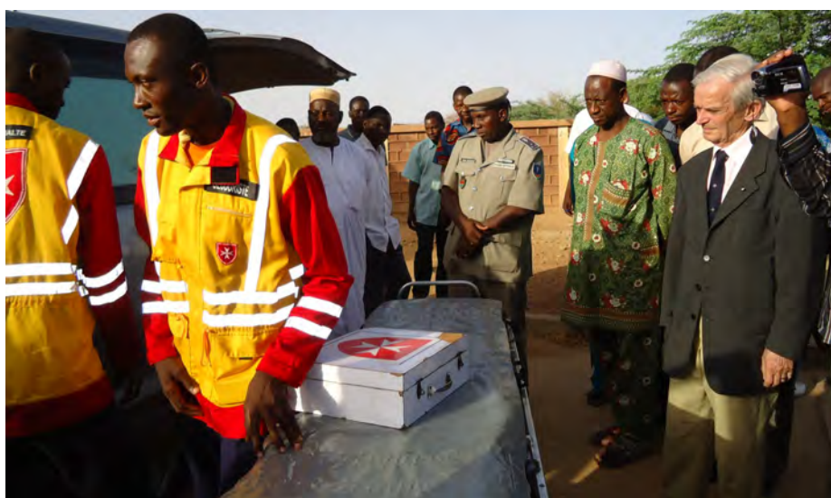
In Burkina Faso alone, about 38,000 people have sought refuge in the refugee camps on the south eastern and northern borders with Mali. Since the services started last June, the teams provided more than 200 transports and emergency responses.

The joint project aims to ensure the transport of Malian refugees in Oudalan, in northern Burkina Faso, from the camps to adequate health facilities. Due to the poor living conditions in