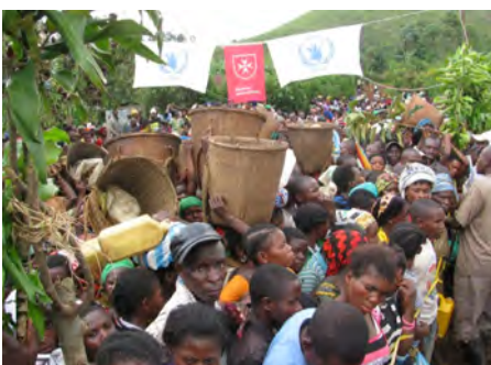
Families received staple food items such as beans, flour and salt.