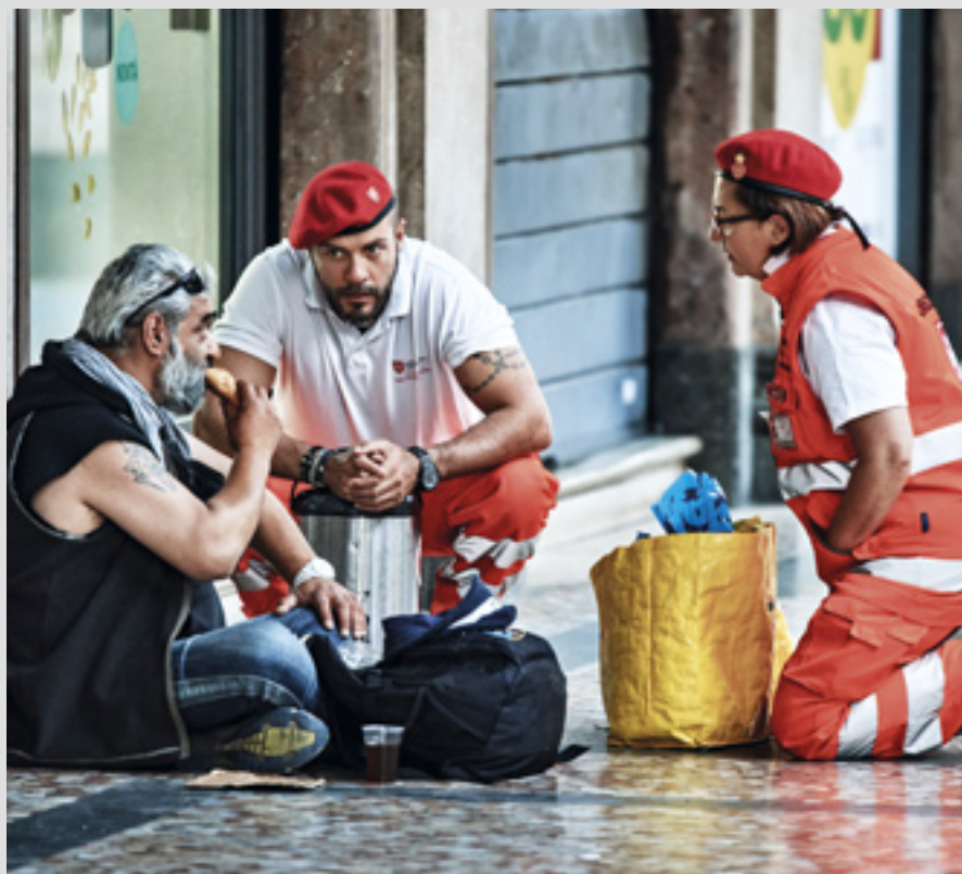
▲ The Italian Relief Corps runs many activities, including distribution of food for the destitute

New activities: a refreshments trolley service for patients at the Sir Anthony Mamo Oncology Centre, launched in 2016; a prison ministry project for young foreign inmates at the Corradino Correctional Facility, with regular visits, and psychological support as they enter rehabilitation programmes. The Order organises an annual Thanksgiving Supper and a summer barbeque for all inmates at the Young Persons Offenders Unit in Mtaħleb; and a forthcoming project to provide shelter and