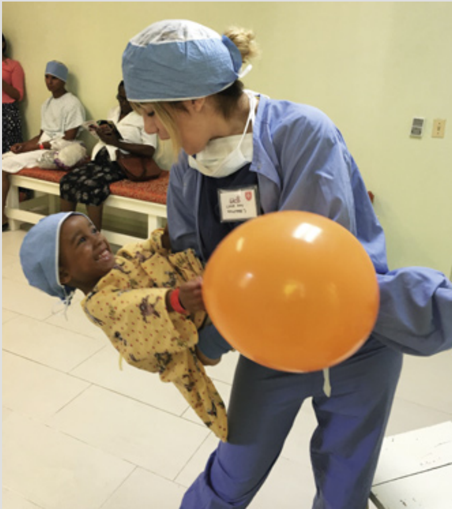
▲ The Dominican Association manages mother and childcare in poor areas of Santo Domingo