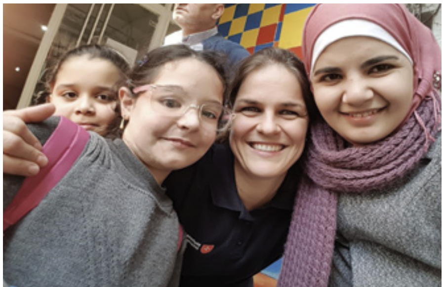
Young refugee students at the Order's school in Kilis, Turkey, integrating into the host country

As well as medical care in the rehabilitation hospital, psychologists and social workers have developed a support programme for patients and their families. Patients come from a cultural background where psychological pathologies are stigmatised, so it is challenging to encourage them to express negative feelings. Making a living in a foreign country while surviving in very crowded housing situations is sometimes more stressful than the experience of violence and harsh conditions during the flight from Syria.