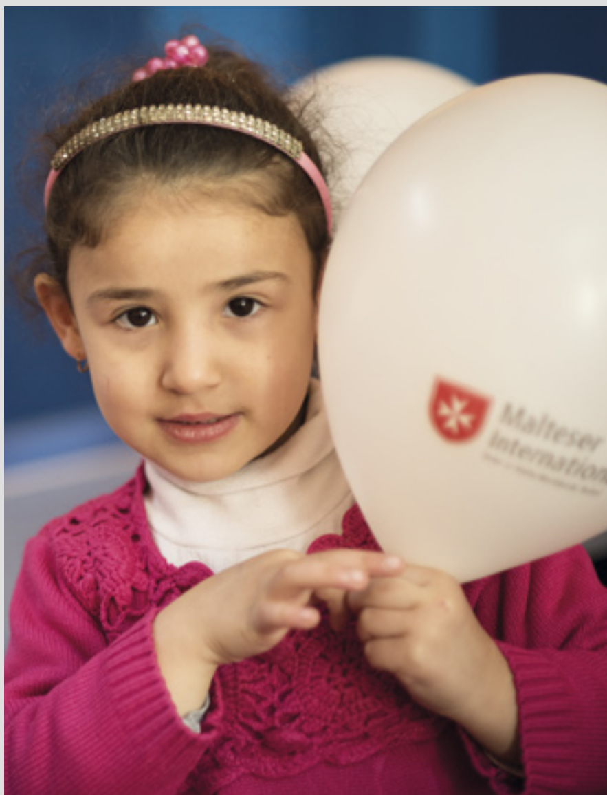
▲ Medical care and schooling for Syrian refugee children in Kilis promises a better future

In Kilis, Turkey, together with a local partner organisation, Malteser International is concentrating on the med-