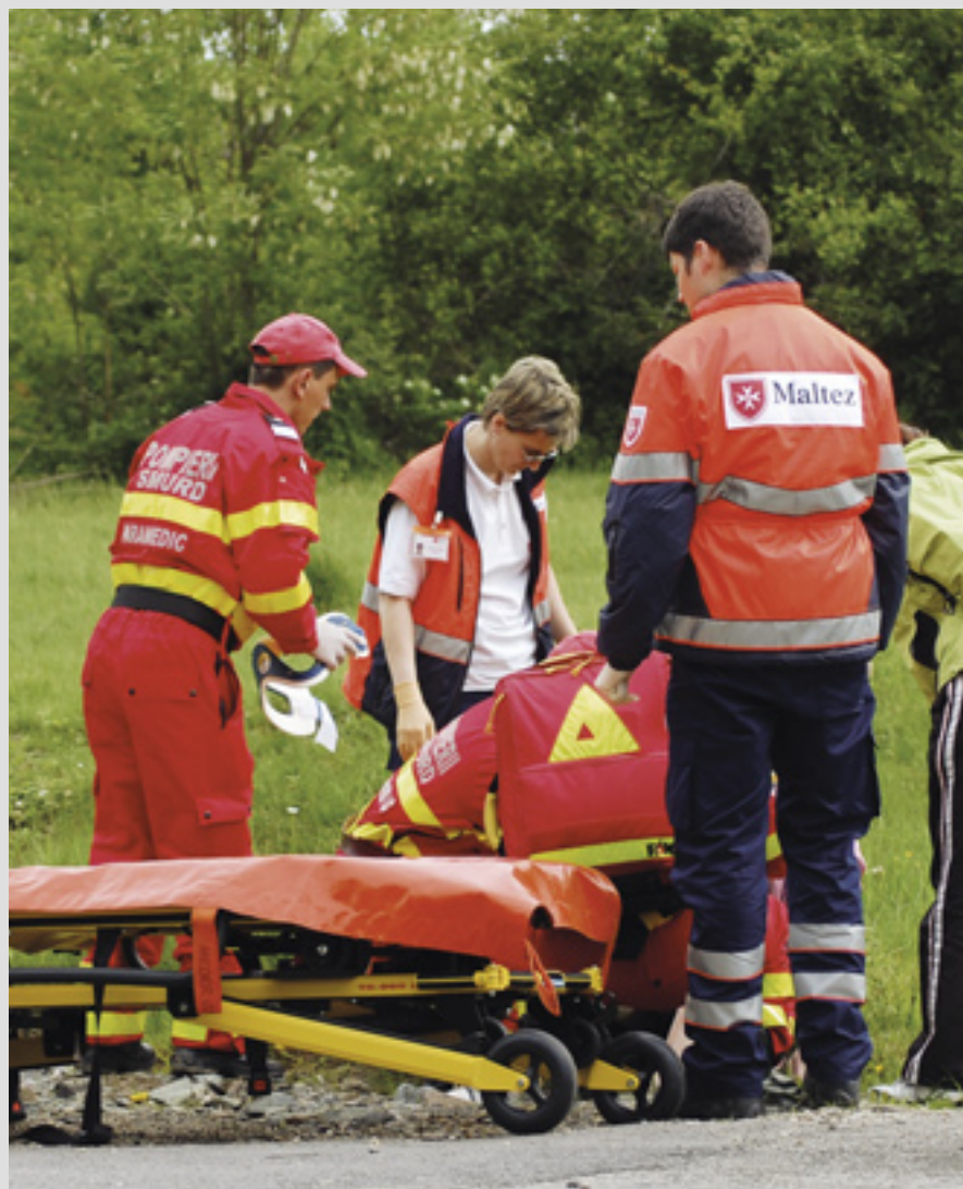
▲ Regular first-aid courses for volunteers in the Serviciul de Ajutor Maltez, Romania: 1,000 work in 100 projects in 26 locations

An important initiative started in 2016 is the development of programmes for