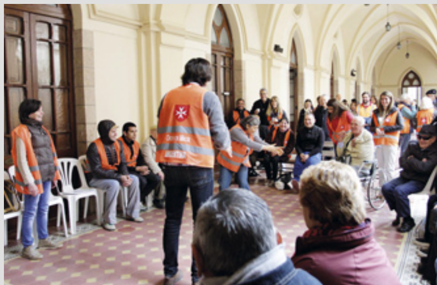
▲ Argentina - Activities and games participation help cheer disabled guests