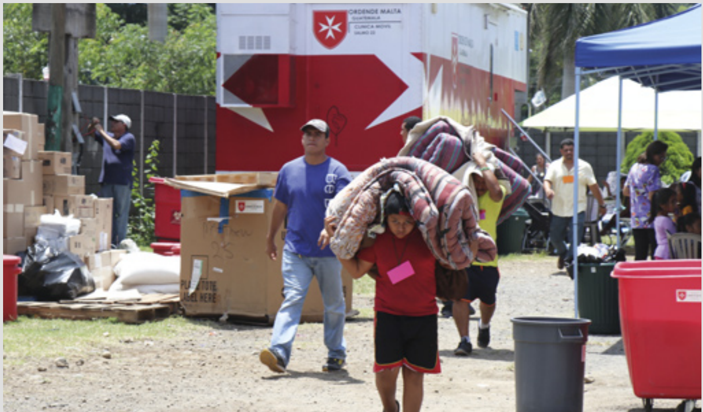
▲ Mobile clinic, Guatemala, delivers basic goods to outlying villages following the volcano eruption

The Order's Embassy has provided direct assistance to local beneficiaries by channelling all donations and dealing with administrative issues. Beneficiaries were the 'Bless the Children' Foundation in the Progreso region, to support children with drug addiction; to 'Our Sisters of Notre Dame' who have set up homes for children and older people in the Progreso region; to