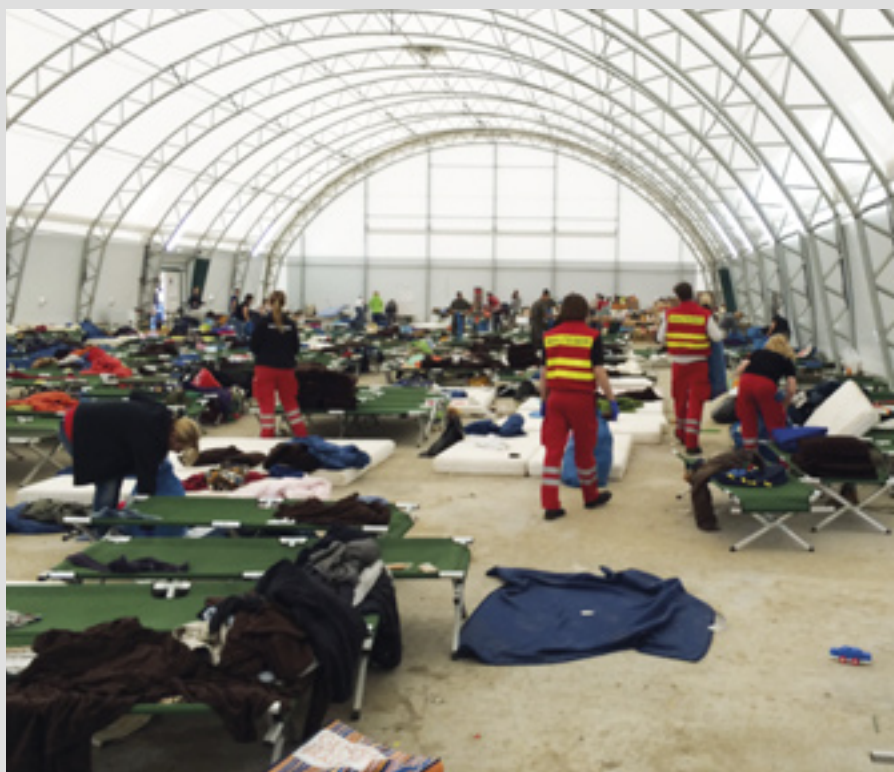
▲ Refugees are cared for on arrival in Austria. Malteser Hospitaldienst Austria has been providing a wide range of care for those in need since 1956