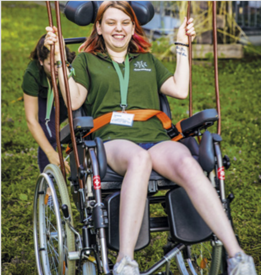
▲ 4,000 volunteers divided into 80 units form the Ambulance Corps in Ireland

conditions offer a relaxing time for all. With 800 participants in 2016 over 12 weekends, the response has far exceeded expected participation in the project. A project to provide food, clothing and support for the homeless in St Stephens Green in Dublin – the ‘Knight Run’ - has been operating since 2014. Guests and carers participated in the Order’s International Summer Camp for Young Disabled in 2016, 2017, 2018.