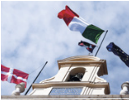
The Order's flag flies over the Quirinal Palace, seat of the President of the Italian Republic