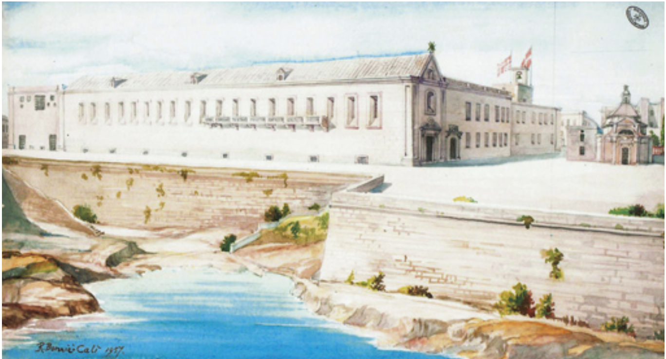
The Sacra Infermeria, Malta