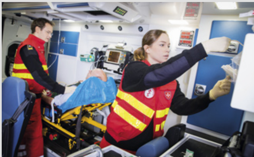
▲ Malteser Hospitaldienst Austria is a significant volunteer emergency service in the country

Malteser Hospitaldienst Austria (which has now unified all its voluntary units) offers a wide range of social activities and programmes, including participation in the Order's International Summer Camp, canoeing in Styria with the handicapped, home and hospital visits, weekly soup kitchen, meals on wheels and leisure activities for the disadvantaged and the elderly. The Malteser Alten- und Krankendienst (MAKD) project: 28 volunteers regularly visit the disabled, the sick, and the homeless in hospitals or hospices, and arrange outings; from Malteser Betreuungsdienst (MBD), 42 volunteers regularly visit 33 disabled at home or in institutions; AIDS Dienst Malteser (ADM) - 13 volunteers make home and hospital visits, run monthly coffee and cake meetings in a general hospital ward, organise leisure activities and outings, and canoeing camps; with Malteser Palliative Dienst (MPD), 16 volunteers come to terminally ill patients at home or in hospital; since 2009 Malteser Medikamentenhilfe (MMH) has been collecting medicines from producers, wholesale traders, and pharmacies and sending them to Afghanistan, Bosnia, Greece, Romania