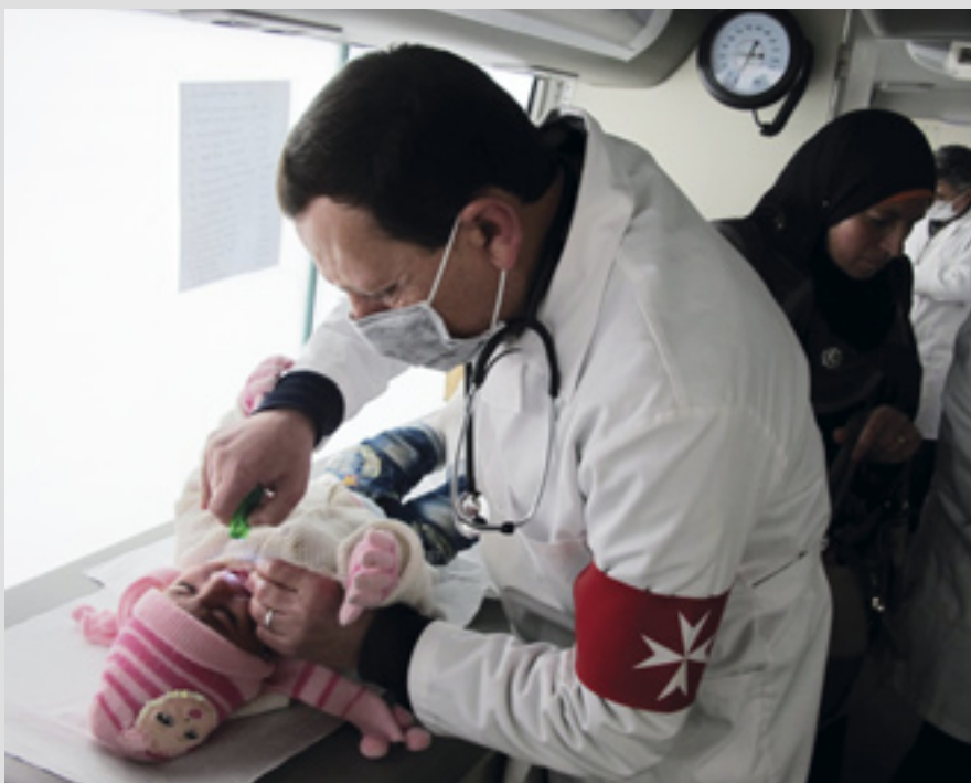
▲ A small Syrian refugee is attended to in the Order's mobile medical clinic in north Lebanon

With the liberation of Mosul in 2017, its citizens began to return gradually, but the situation is precarious, both medically and socially. Malteser International has distributed relief goods and is gradually rebuilding healthcare capacities and offering psychosocial support to the traumatised. They will intensify their work in training and income generation and have launched 'Cash for Work' programmes, with many women participating in courses promoting good hygiene, becoming teachers and helping their communities to respect practices that can prevent epidemics.