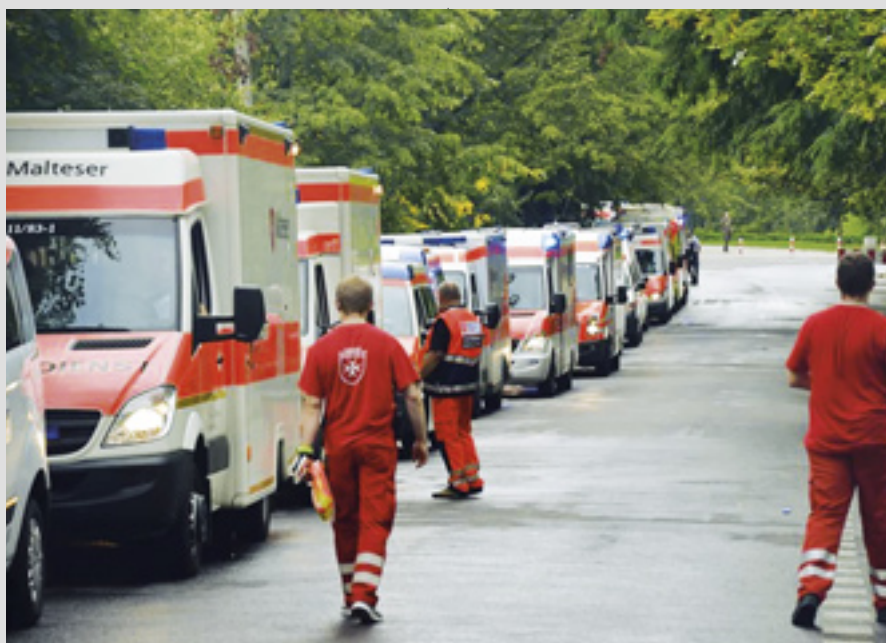
▲ Lineup of Order ambulances – medical support for World Youth Day in Krakow, 2016

mentoring for small numbers of homeless youths. A team of members and volunteers have accompanied guests to the Order's International Camps each year – 2016, 2017, 2018.