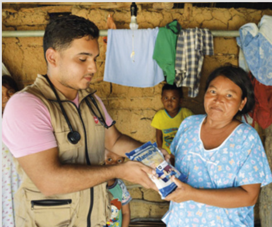
▲ Emergency kits are distributed following disastrous floods in Colombia

Following a recent natural crisis - the avalanche which hit the provincial city of Mocoa in 2017, killing hundreds and leaving thousands homeless, the Colombian Association shipped four containers of medicines and emergency supplies and 17 tons of nutrition supplements.