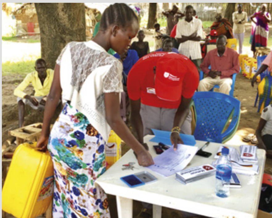
▲ Work continues in Africa to train local farmers in agricultural nutrition and seed cultivation

In a sustainable agriculture project established in 2015, the organisation is working with its local partner to improve nutritional agriculture in Maridi, Mambe and Ngamunde. Tools, plants and seeds plus cultivation instructions are distributed to 1,000 households where husbands died in the civil war.