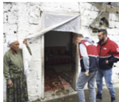
Conditions for many in Albania are very precarious. The Order is providing support to the most needy in the north of the country

We believe that being near our returnees at a time when they feel they are foreigners in their own country, with our staff and volunteers caring for them professionally, is fuelling our energies in support of their reintegration into Albanian society.