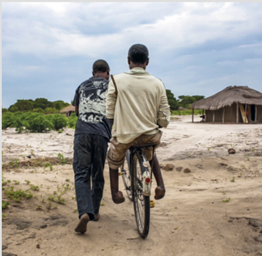
▲ In Mozambique, the Order works with leprosy victims, providing specialist care and training

Segou, Sikasso and Mopti and Bamako district, as well as a specialised centre for children with mental disabilities.