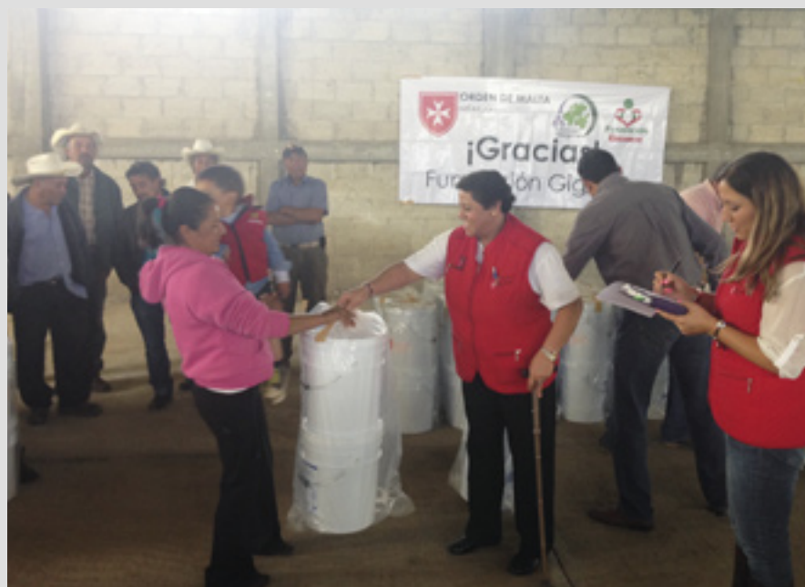
▲ Distributing water filtration equipment after natural disasters

In January 2017, parts of Peru were battered by almost unceasing rains with consequent floods, landslides, loss of life and more than 100,000 people losing their homes. Over half a million were affected by the storms and the resulting damage, over a number of months. In response, staff from Malteser Peru, and Order volunteers, provided food, water, and clothing to victims in Ate in April 2017, and to victims in Piura in May.