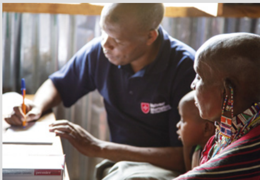
▲ A home visit to a patient suffering from tuberculosis, Oloitokitok, Kenya

The Order supports 12 clinics around the country – at Kayes, Koulikoro,