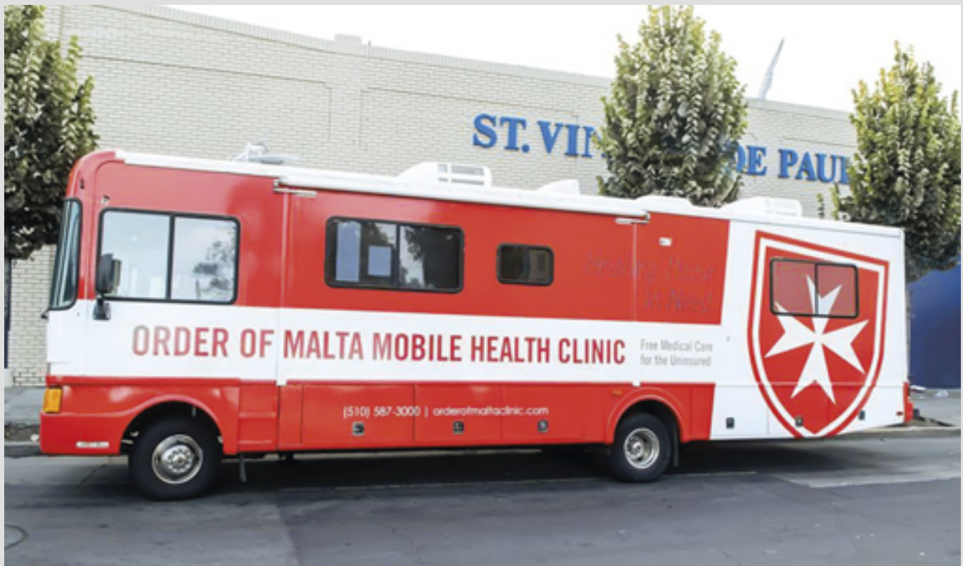
▲ The free mobile clinic operated by the Order's Western Association in Oakland, California, treated over 3000 patients in 2018