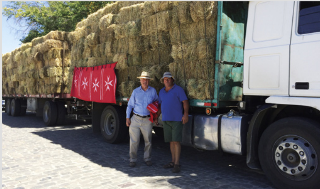
▲ After recent bushfires in Chile, the Order provided essential animal feed

In Loncoche the Shelter Home 'Blessed Karl of Austria' hosts 30 elderly people and provides them with four meals a day. The 'Training Institute Auxilio Maltés', established in