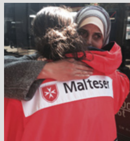
▲ Closeness counts: Malteser Hilfsdienst runs care programmes nationwide

Trained staff also run outpatient care for sufferers in their own homes, and outpatient services also include training for relatives and advice on nursing care and long-term care.