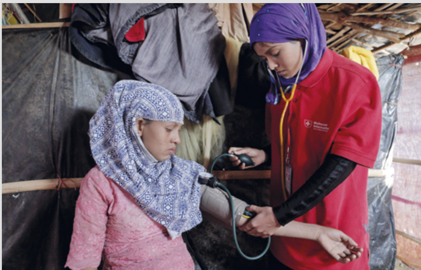
▲ Providing care for displaced Rohingya in refugee camps

Malteser International has been working in Myanmar since 1996, employing its own staff from 2001. It now employs more than 350 local staff in Rakhine, Shan and Kayin states, operating in pri-