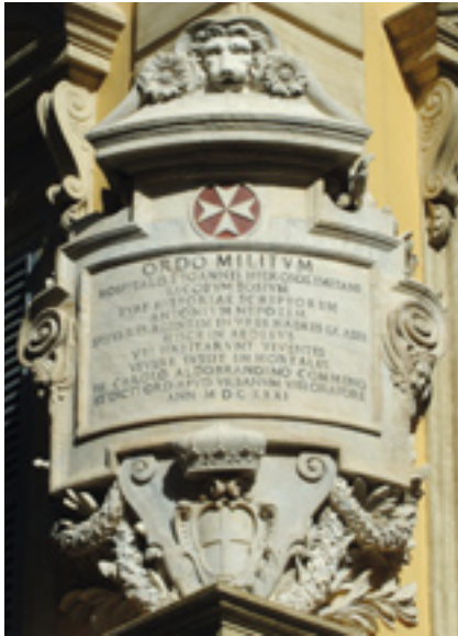
Memorial plaque, Magistral Palace, Rome

tremely serious conflicts in the Middle East, with particular concern expressed for the Syrians and Iraqis.