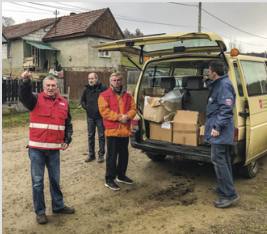
▲ In Eastern Europe, regular deliveries of supplies to impoverished local villages are a lifeline