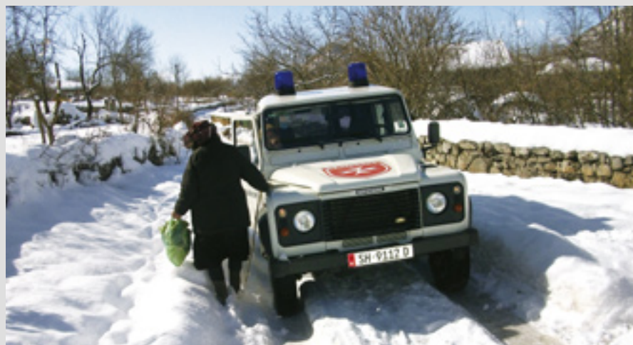
▲ Harsh winters in the north of the country mean emergency callouts for the Order's Relief Organisation in Albania (MNSH)

In 2017, the Multidisciplinary Socio - Medical Centre for Roma and Egyptian communities was launched in Lezha, with activities for 15 pre-school children, after school for 25, sports for 35 youngsters, and illiteracy courses for adults, as well as legal assistance and health services.