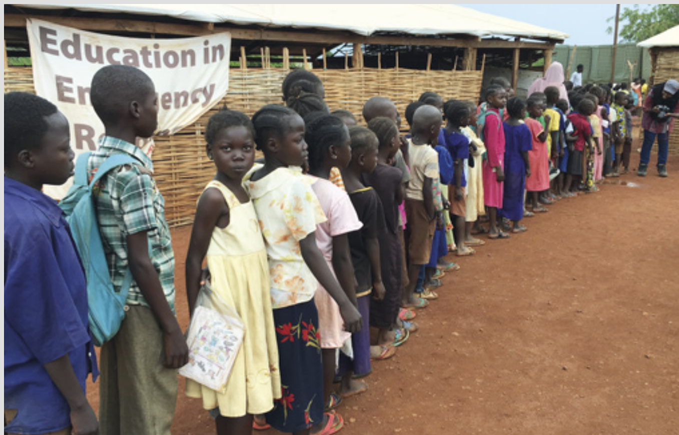
▲ School pupils line up for hot, nourishing meals in South Sudan, provided by the Order's Malteser International

Ordre de Malte France has also signed a cooperation agreement with the DAHW (Deutsche Lepra- und Tuberkulosehilfe e.V.) for detection of tuberculosis and leprosy including cases in remote villages. A second partnership has been signed with Hilfe für Senegal who donated medical equipment (wheelchairs, crutches, etc.) to the dispensary in Gorée.