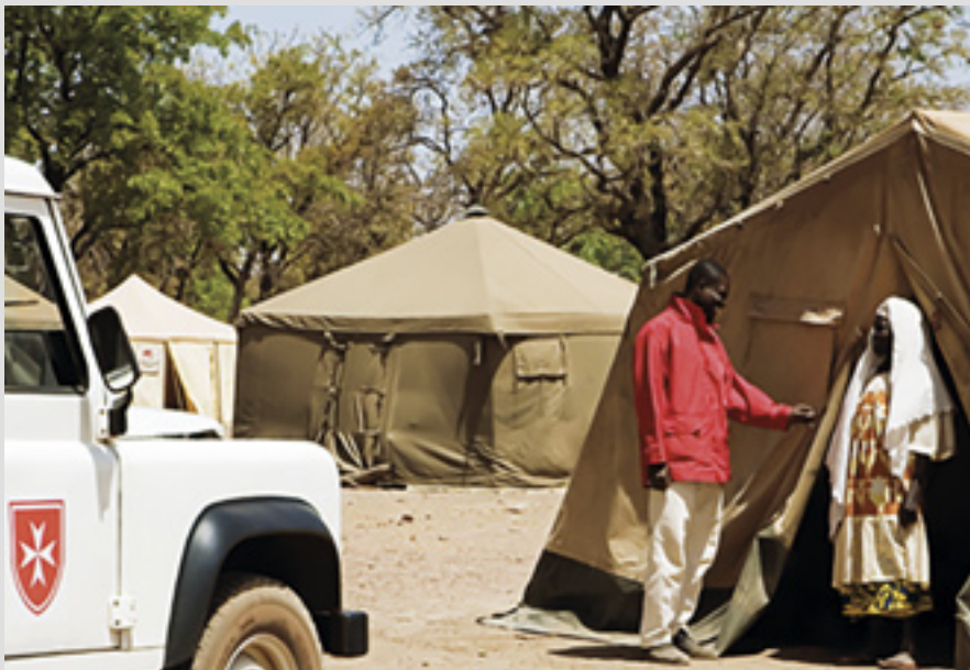
▲ The Order has teams of ambulance drivers and first-aiders in Burkina Faso, serving outlying areas with medical checkups and free medicines

Particular victims of the crisis are the increasing numbers of street children. They have a daily struggle for survival in the big cities and are usually entirely at the mercy of violent and arbitrary be-