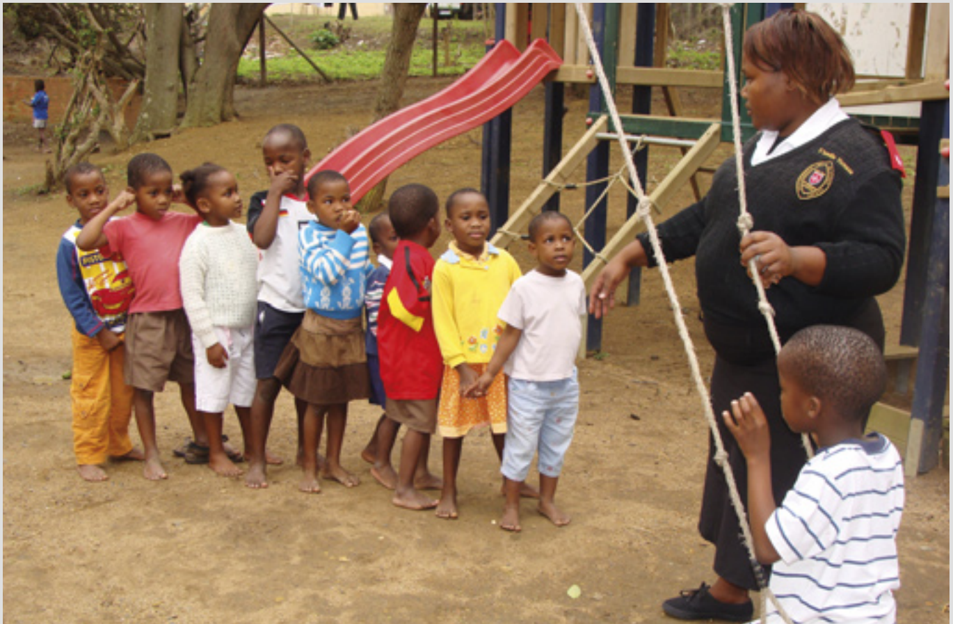
▲ At the Brotherhood of Blessed Gérard, South Africa, teachers work with young orphans

Hospice and palliative care: there is residential palliative care for terminally ill patients in the inpatient unit. It can accommodate up to 40 patients. In