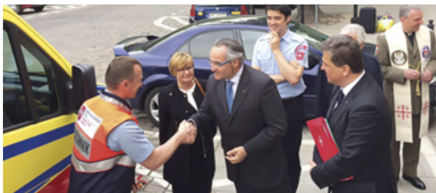
Grand Hospitaller congratulates volunteer teams from the Order's Polish Relief Organisation who work in medical and social assistance projects around the country

Hospitaller says that right now, that response is particularly focussed on migrants and refugees. He notes that in Germany the Order has extensive experience of caring for these groups, since the events of 1989 – and this brings the know-how which promotes the sharing of advice and experience. And he observes that the needs of these groups are the same needs – the people come from different countries, but their needs are the same: for clean water, sanitation, hygiene, food, activities.