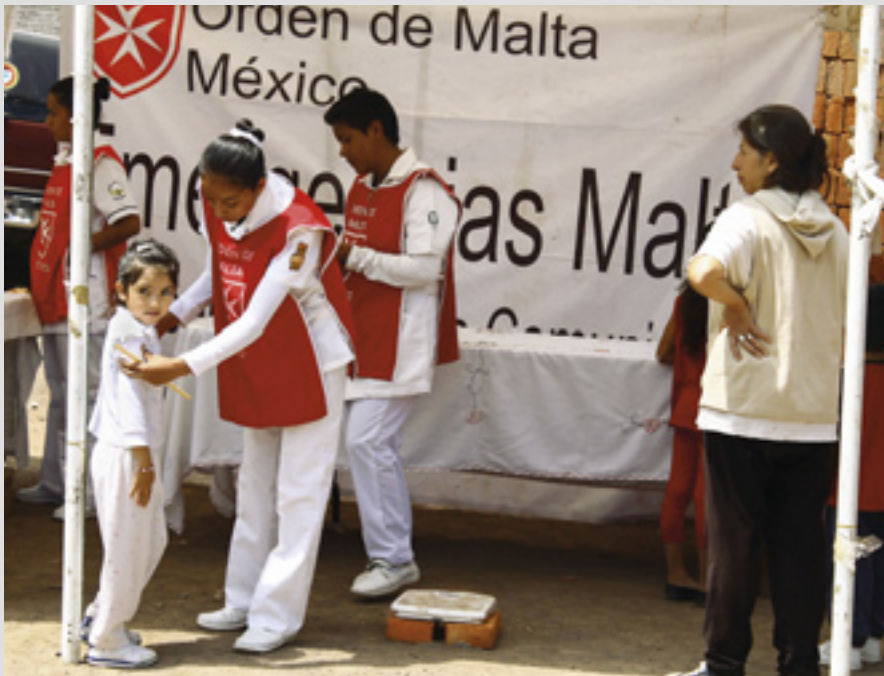
▲ Healthcare event for disadvantaged youngsters in Mexico City