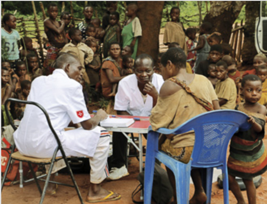
▲ A mobile clinic in northern Congo brings care to local communities and indigenous peoples

haviour. In two homes of the Fondation Stamm, in Bujumbura and Ngozi, funded by Malteser International, the children receive both protection and comprehensive support and care.