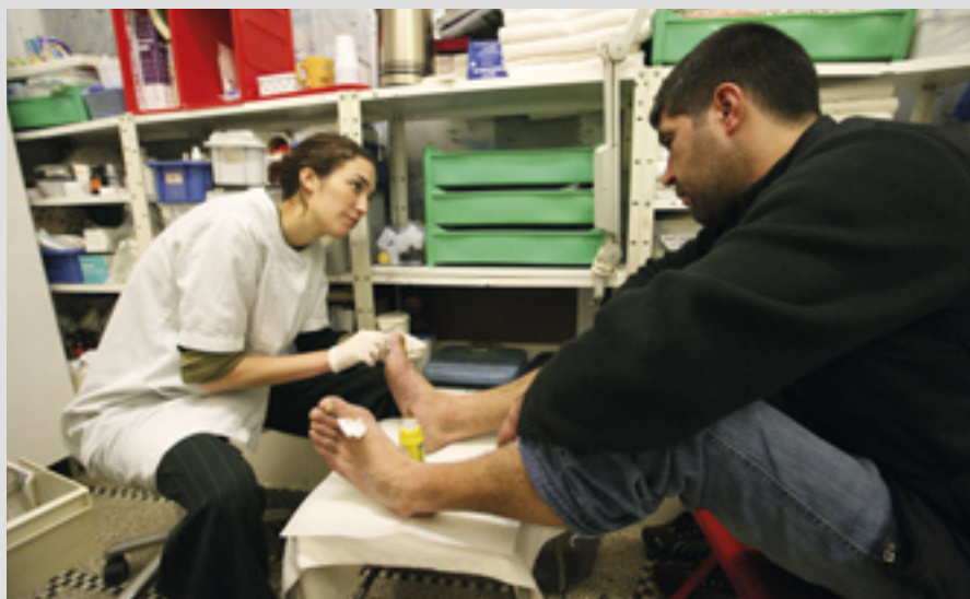
▲ Three day centres for the homeless in Belgium offer their guests showers, laundry, warm food, clothing and basic medical care

The Embassy of the Order in Bosnia and Herzegovina, in collaboration with German Malteser Hilfsdienst teams, organises an ambulance service in Medjugorje during the pilgrimage season (April to October) with local volunteer doctors and helpers (averaging 6,000 medical interventions). The Embassy also supports Catholic parishes, with help for restoring and re-equipping churches, such as the support for the parish church of Bl.Majke Terezije, Vogošća, recently donating bells for the bell tower and material to build a wooden pedestrian bridge to connect the parish with the village. In collaboration with the Law Faculty of University of Sarajevo and the Bucerius Law School in Hamburg, an international university post-graduate exchange programme trains students in constitutional and EU law.