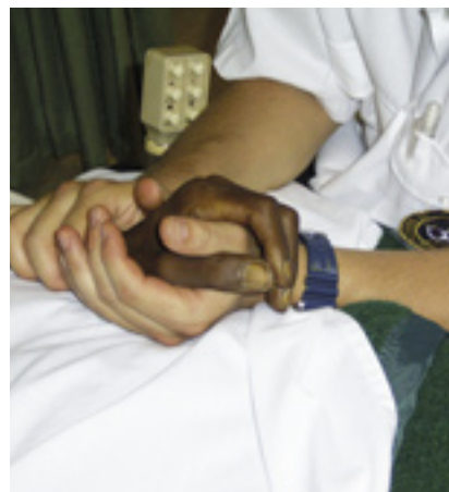
The Care Centre and hospice comfort the sick and the dying who would otherwise suffer alone and untreated