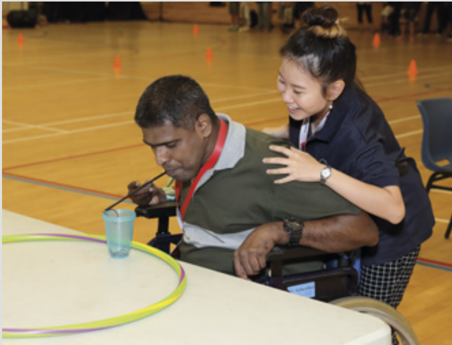
▲ The Asia Pacific summer camp for young disabled is now an annual event