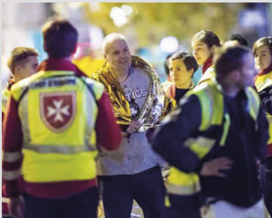
▲ Ordre de Malte France intervenes during the Bataclan attack

A special focus is programmes for leprosy prevention and care in Senegal (Tilène, Ziguinchor), Cameroon (Guili, Guider and Mokolo), Gabon (Ebeigne), India (Pondichéry and Shadipur), Brazil (Macapa), Egypt (Abou Zabal) and in Cambodia (Kien Khleang and Pnom Penh), Vietnam and Laos. In addition, the MALTALEP programme supports international teams in leprosy research.