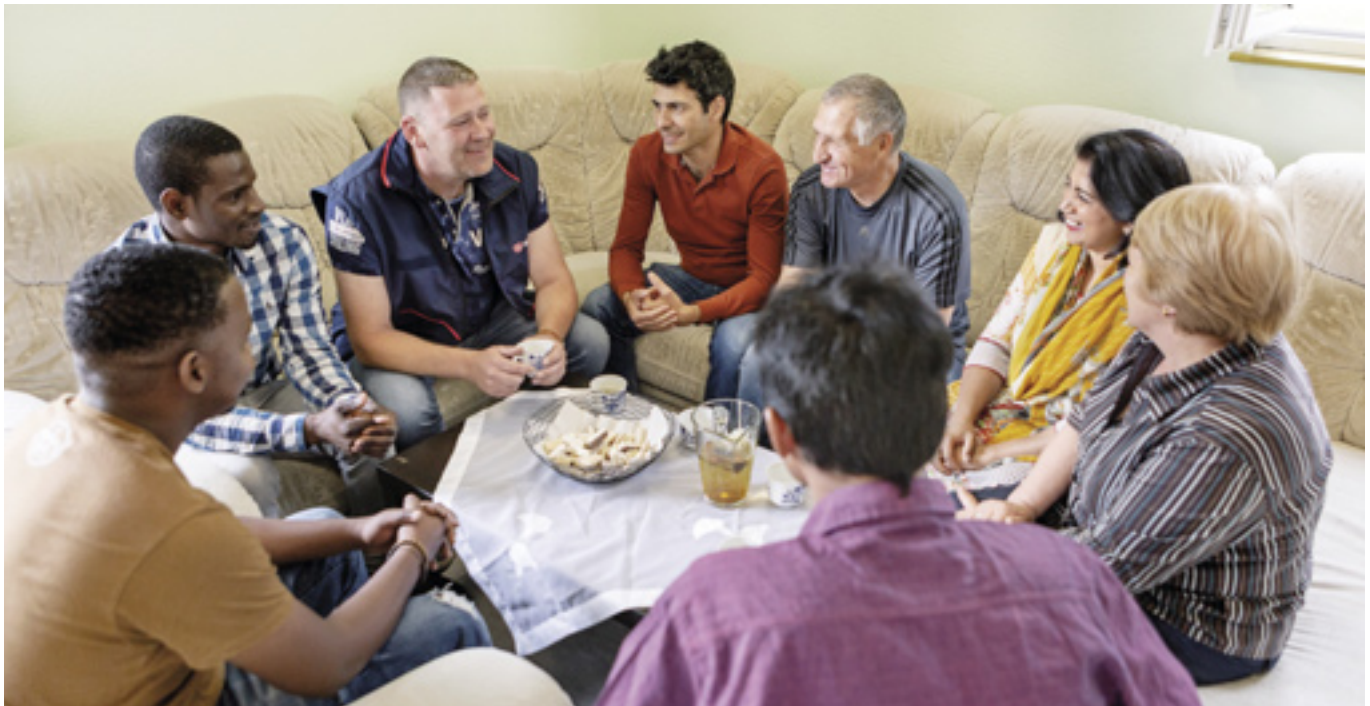
Malteser Germany runs integration programmes in a range of facilities

The consideration of "migration" as a problem can be from three points of view: First point of view is that of the people who make an experience of life-threatening situations, before which there is no choice, but to flee: to move away, to migrate from life-threatening to peaceful or life-assuring situations of places. In this case, the reaction of the communities of the world is to help remove the source of the life-threatening danger, whatever it may be. If it is war, as in the case of the present migration, then the reaction of the world is to quench the fires of war. A cessation of hostilities