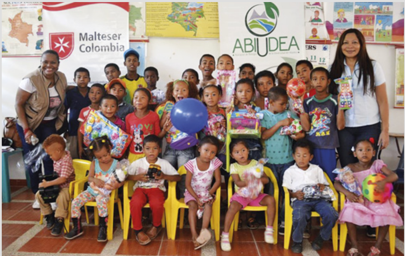
▲ Wide ranging projects in Colombia to aid refugee and indigenous groups in disadvantaged regions include educational activities for youngsters

ern Brazil: carries out activities in São Paulo through the Centro Asistencial Cruz de Malta, with members and 200 regular plus 200 occasional volunteers. Their health care projects aid nearly 60,000 people a year with medical care.