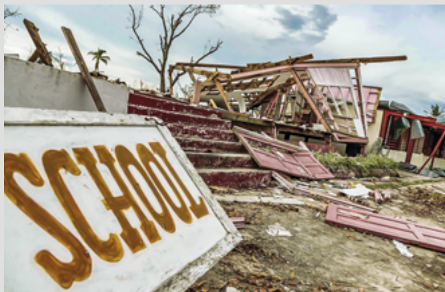
▲ The Order runs disaster risk reduction programmes in southern Asia, where hurricanes are a regular phenomenon

In 2016 the Embassy cared for 60 sick people, some of them terminal patients, providing medicines and food through the 'Healthcare Tbilisi' project. From 2017, among the Embassy's proj-