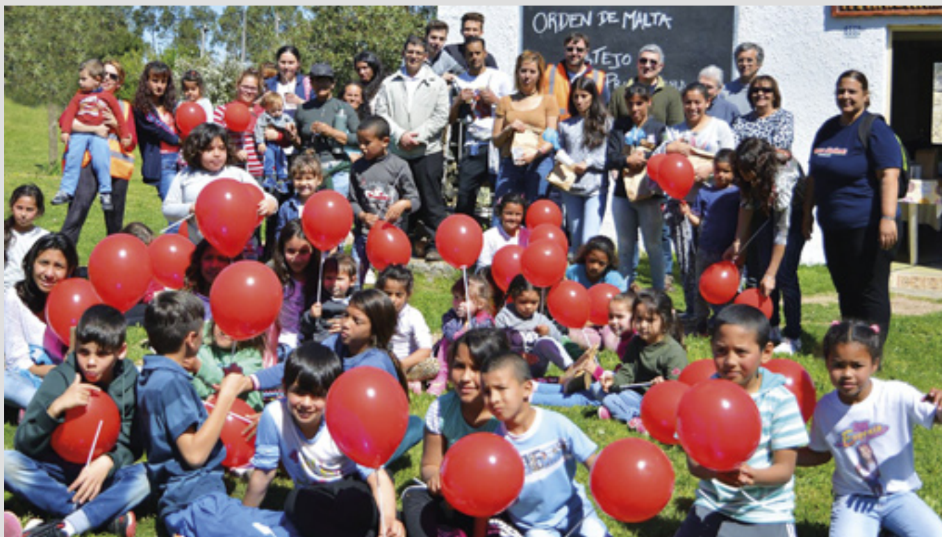
▲ Order volunteers regularly prepare lunches and picnics for poor children in Montevideo, Uruguay

tainer of beds and furniture donated by the Swiss Association); supports the 'Hogar Casita del Señor', a home for elderly, low income women, which was built with a donation from the Association; in Canelones, on the ground floor of the Association's new premises, a residential hospice, 'Hogar Monseñor Jacinto Vera', shelters 35 young mothers and their children; a night and day shelter, 'Hogar La Milagrosa' houses 30 people each night and 30 each day. The Association also provides dental prevention and therapy to a school of 220 pupils, in Junta Local. Education initiatives: courses of catechism and arithmetic for the children living in one of the Montevideo homes; a computer training centre established in the Association's premises in Canelones. The 'Cocina Solidaria 2017' fed 70 poor children in the Fortaleza Barrio, Montevideo, over the cold season, with members and volunteers providing 1,000 lunches and 3,000 'empanadas' (pasties).