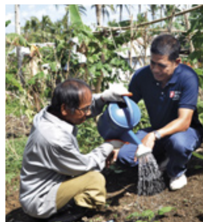
Encouraging micro-finance programmes helps local farmers to grow their own crops, for market as well as for home

Ultimately it is about humanising migrants. Our narratives and projects need to generate empathy and prevent the dehumanisation of migrants in mainstream narratives. Stories of individuals, emphasising commonalities (as opposed to celebrating diversity), can help address this issue. We need to look at connections between host communities and migrants that promote understanding and respect such as volunteering. Ultimately the message of a Shared Humanity is one that should resonate with everyone relying on empathy and reciprocity. They contribute to advocate for the basic minimum standards of human dignity that must be afforded to all migrants, irrespective of status, irrespective of whether you believe there should be more or less migration.