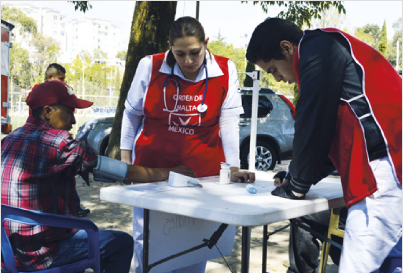
▲ One of the Order's many support activities, from food parcels to medicines, to the disadvantaged