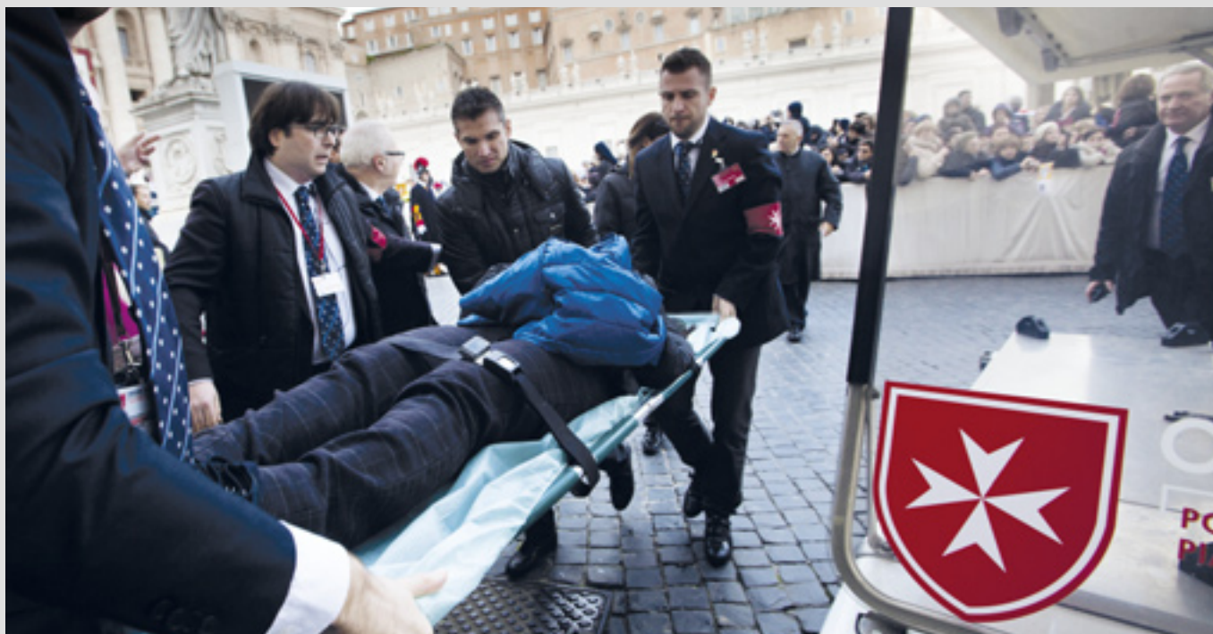
▲ The First Aid Post operates every day on both sides of St Peter's Square

From April 2018 first aid services in San Paolo Fuori le Mura and San Giovanni in Laterano have been added.