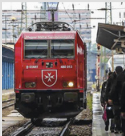
▲ The Hungarian Charity Service works in 350 locations around the country, benefiting 240,000 annually

A founder member of the Charity Service, Fr. Imre Kozma organised assistance for 48,600 East German refugees in 1989 after the fall of the Berlin Wall. Today it has 5,000 regular and 15,000 ad hoc volunteers and is one of Hungary's largest providers of social care. It has 350 locations with 142 local groups, 210 institutions and 840 employees, caring for the elderly, the homeless, the disabled, disadvantaged families and children, and drug addicts. It also operates an emergency service in times of natural disasters. Health care activities cover a hospital, nursing homes, consulting rooms, a mobile pulmonary screening station, a medical device rental service and a vo-