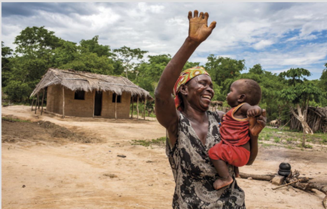
▲ The Order focuses on care for leprosy sufferers, showing them how to look after themselves

itation, health and food security, now adds the largest Ebola programme in Africa.