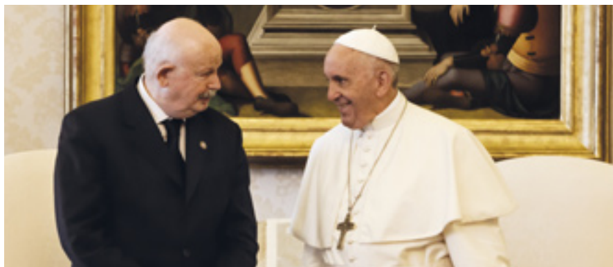
His Holiness Pope Francis greets the Grand Master for the annual audience, Vatican