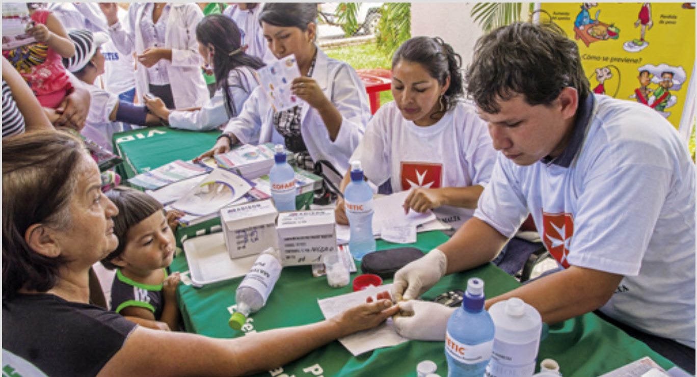
▲ World Day Against Diabetes, Bolivia: the Order, in collaboration with the University of Santa Cruz de la Sierra

Varela, south of Buenos Aires, provides free dental and eye care to more than 100 underprivileged children daily. For complex cases it has a cooperation agreement with the University of La Plata.