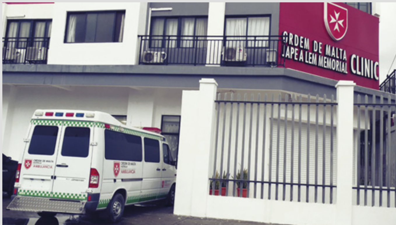
▲ The Order's clinic in Timor-Leste treats 200 patients every day

time called the Malteser Foreign Aid Service. Fifty years on, the organisation now has a special emphasis in the central provinces, among the poorest areas in the country, on disaster risk reduction awareness, in particular for the risks posed to the disabled caught up in these crises. Training workshops for their inclusion in DRR are given at community, district and regional level. In Vietnam 7.8% of people have one or more disabilities. Malteser International also runs a variety of activities: hygiene education in schools, nutrition awareness, forest preservation as well as disaster preparedness in villages. Ordre de Malte France runs six medical centres in the country, with operating theatres specialised in treating leprosy. The centres in Ben San, Cantho, Nha Trang, Quy Hoa and Ho Chi Minh Ville deal with rehabilitation surgery for leprosy patients, in Diling treatment is for diabetic and leprosy ulcers and in Quy Hoa, specialisations are in ophthalmology.