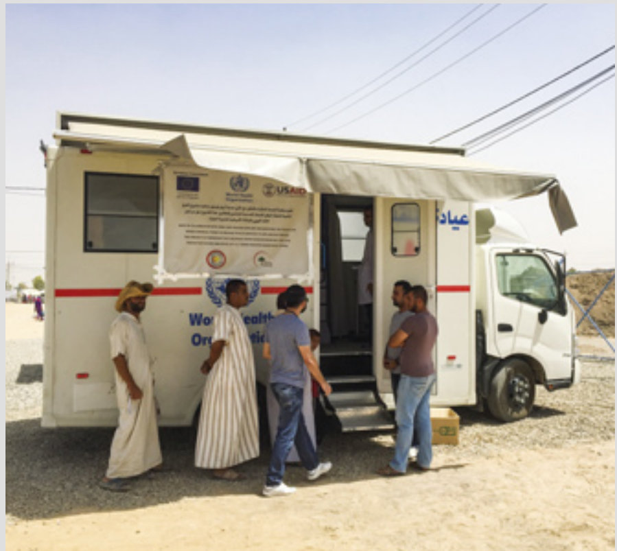
▲ Malteser International mobile medical teams provide medical aid to IDPs in camps around Erbil, Iraq

For the elderly in rural areas, where the exodus of the young for jobs in the cities brings loneliness, there are three day care centres and five 'warm homes', bringing companionship and social activities. They cater for 55 villages with a total of 1,168 elderly, for