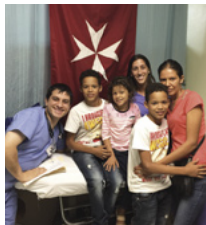
Volunteer medical missions in the Dominican Republic treat locals free of charge, attending to thousands of patients each year

In 2017 the San Juan Bosco Clinic celebrated 25 years of service to the community of documented and non-documented poor in Miami. Members of the Cuban Association continue to volunteer their time and over 800 patients are seen every year and, where necessary, are referred to specialists who provide over 2,800 annual visits free of charge.