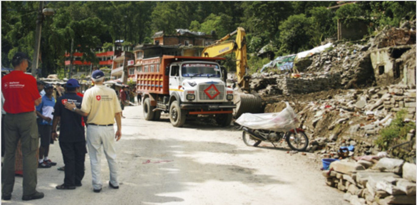
▲ The Order's international relief agency, immediately on site after the Nepal earthquake with emergency aid, is now rebuilding homes and livelihoods

mary health care, WASH, Disaster Risk Reduction programmes, climate change adaptation and post disaster relief. Another focus is health care for displaced people (the Rohingya) who have fled from Myanmar to Thailand and Bangladesh, where they do not have refugee status and are therefore not eligible for medical care.