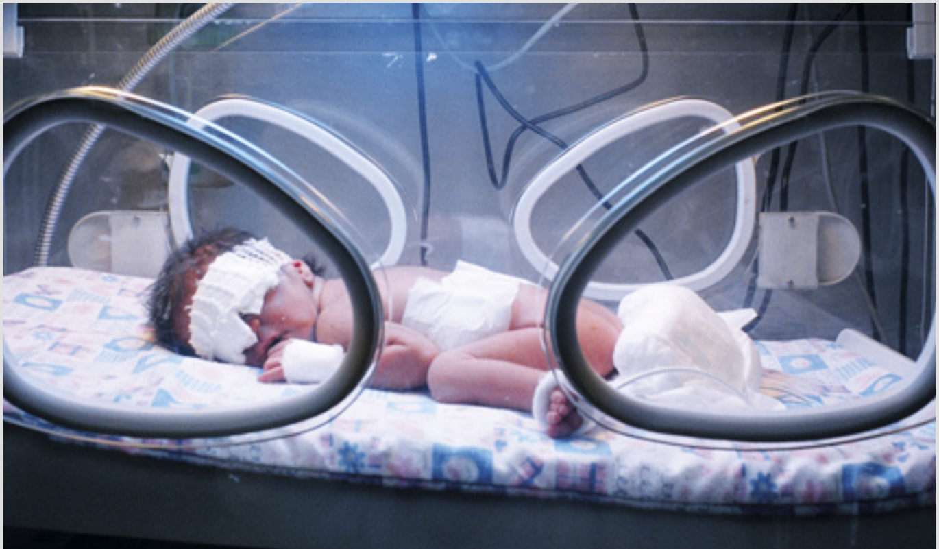
▲ The Order's Holy Family Hospital in Bethlehem offers the only neonatal intensive care unit for newborns in the region

A Dignity Loan programme launched in 2013 in the Salfit region by the Order's Representative Office to Palestine continues to give microeconomic loans to local small businesses, creating jobs and improving economic outcomes. In consultation with local community partners, the interest-free loans typically have a repayment period of 1-3