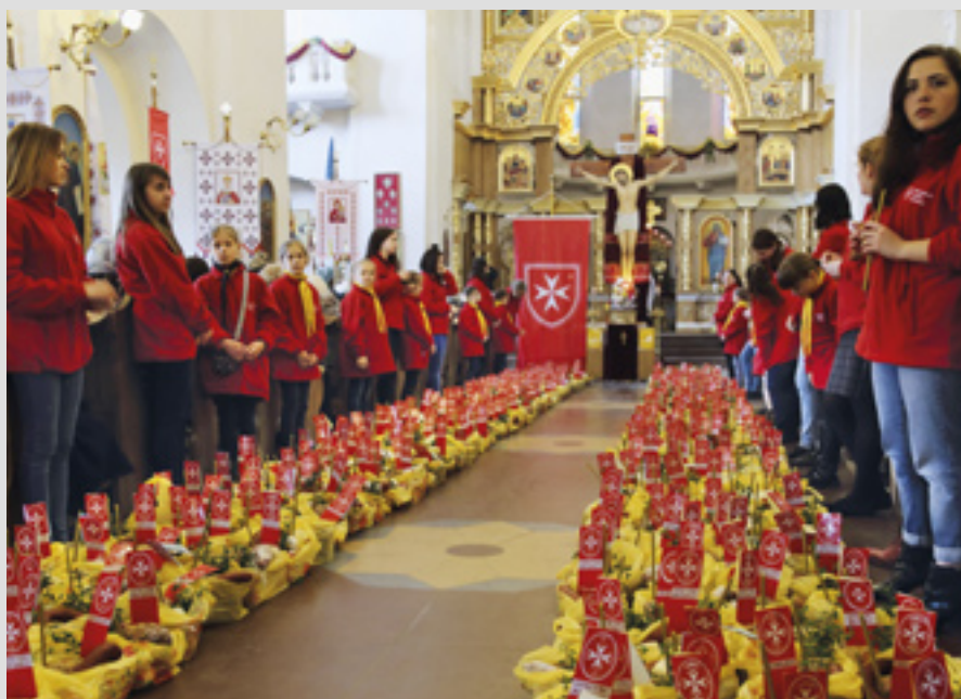
▲ Every Eastertide, the Malteser Relief Service in Lviv, Ukraine, prepares hundreds of Easter baskets for those in need

those in need: the 'Santa Micaela' serves 350 people a day totalling over 150,000 meals each year – reflecting an increase in Spain's new poor; 'Virgen de la Candelaria' serves 150 meals daily to immigrants, poor families and the elderly; 'San Juan Bautista' newly opened in 2016, feeds 200 a day. In 2017, the centre was extended to include a health unit, showers and washing machines and a clothing distribution centre. Added to these is 'Desayunos de Cuaresma' in Atocha, which brings the homeless food and company during the 40 days of Easter. A new project offers soup and sandwiches to the homeless at night, twice a week; in another, 20 volunteers visit lonely elderly - 'Companeros de Malta'.